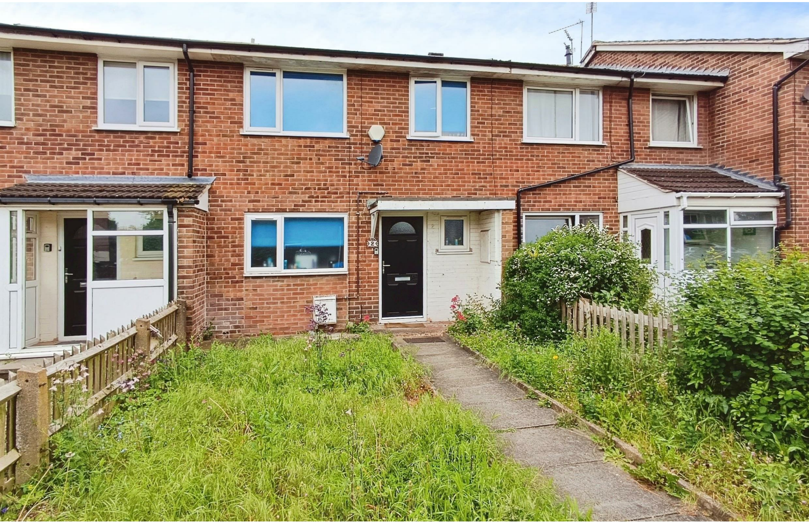
2 Saxton Close, Beeston, Nottingham, NG9 2DU