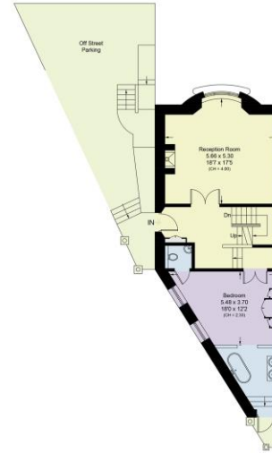
Ground Floor Approximate Area = 70.2 sq m / 756 sq ft