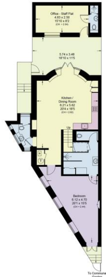
Lower Ground Floor Approximate Area = 75.7 sq m / 815 sq ft