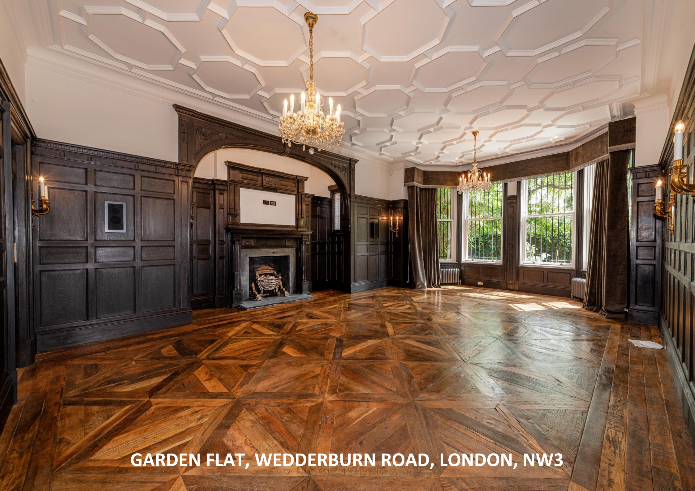
GARDEN FLAT, WEDDERBURN ROAD, LONDON, NW3