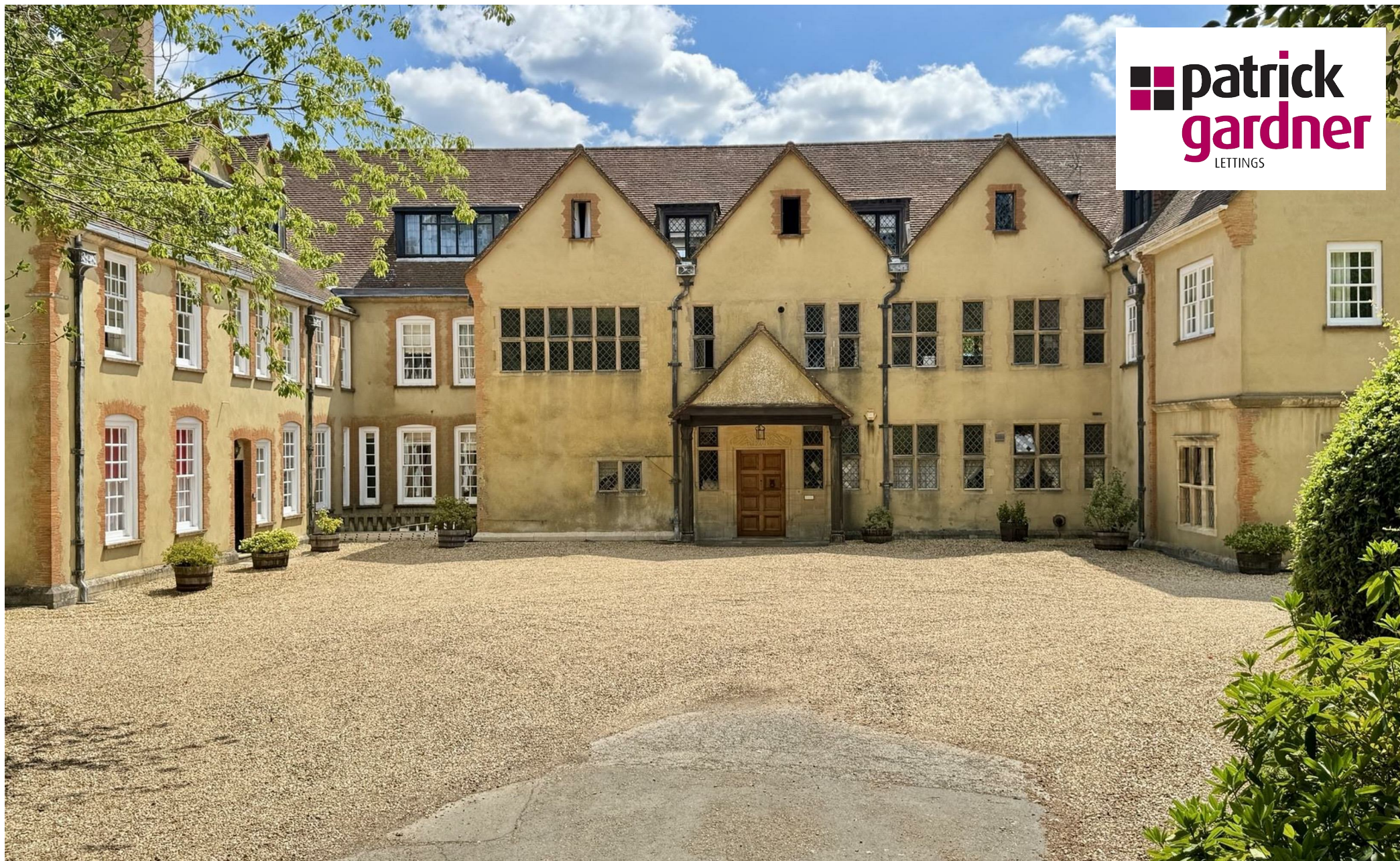
Goodwyns Place, Dorking, RH4 2AW