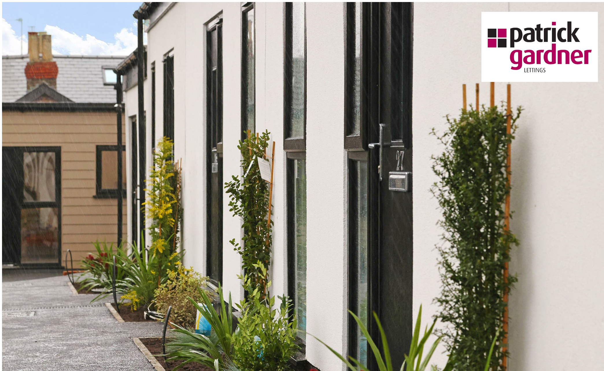
Vincent Walk, Dorking, RH4 3JB