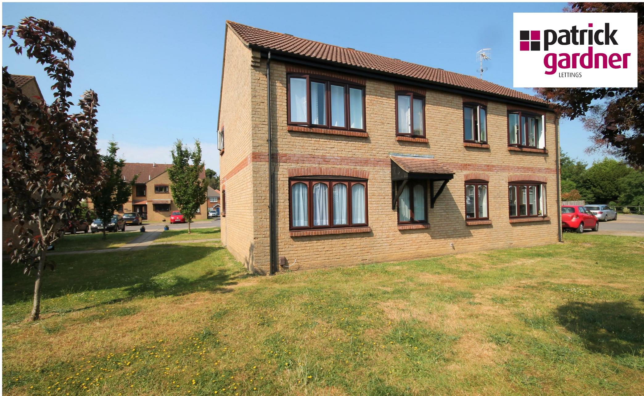
Willowmead, Dorking, RH4 1UE