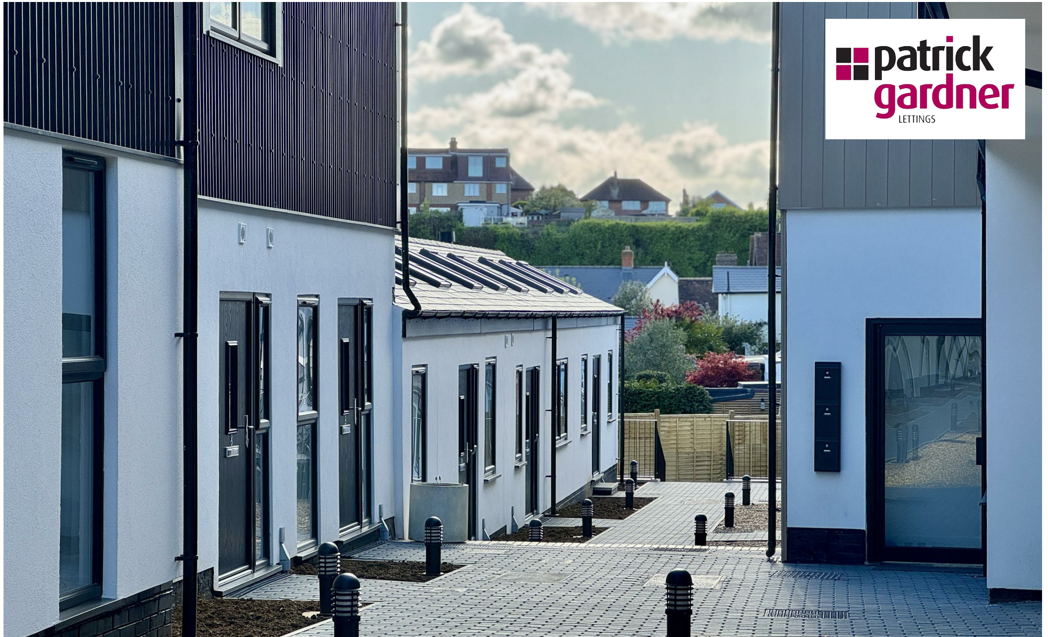
Green Yard, Vincent Walk, Dorking, Surrey, RH4 2FZ