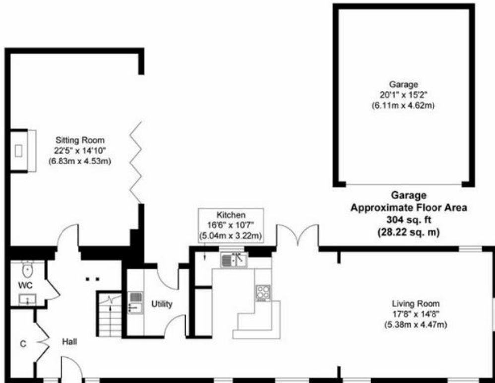
Ground Floor Approximate Floor Area 1122 sq. ft (104.23 sq. m)