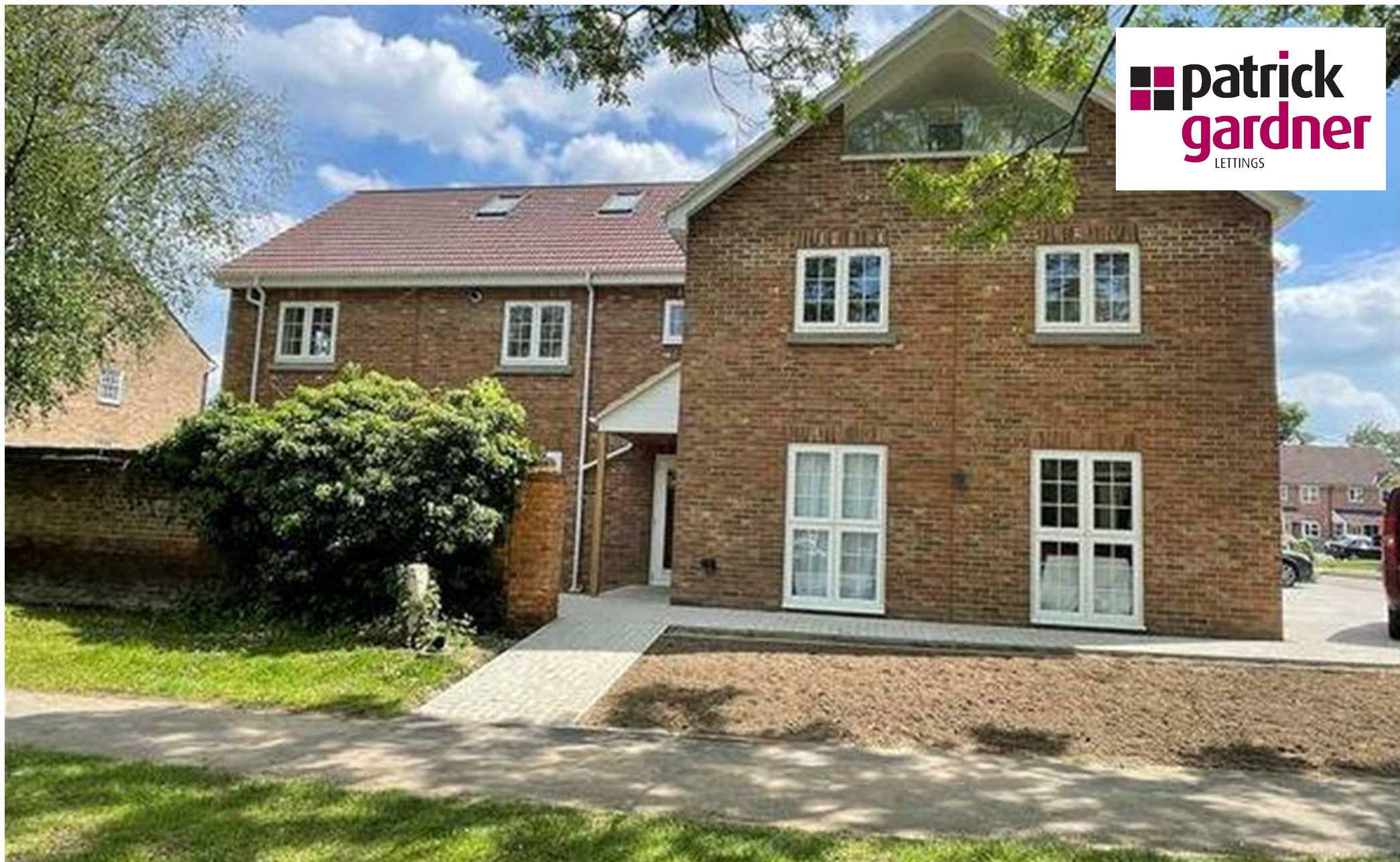
Whitmores Court, 1 Whitmores Close, Epsom, KT18 7JY