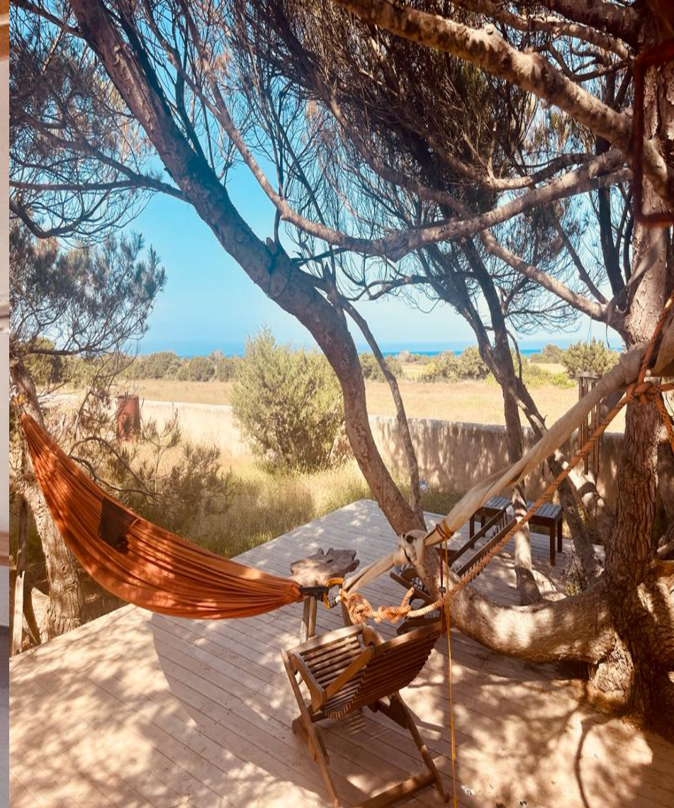
V127 FORMENTERA ES CARNAGE 3 BEDROOMS DETACHED VILLA