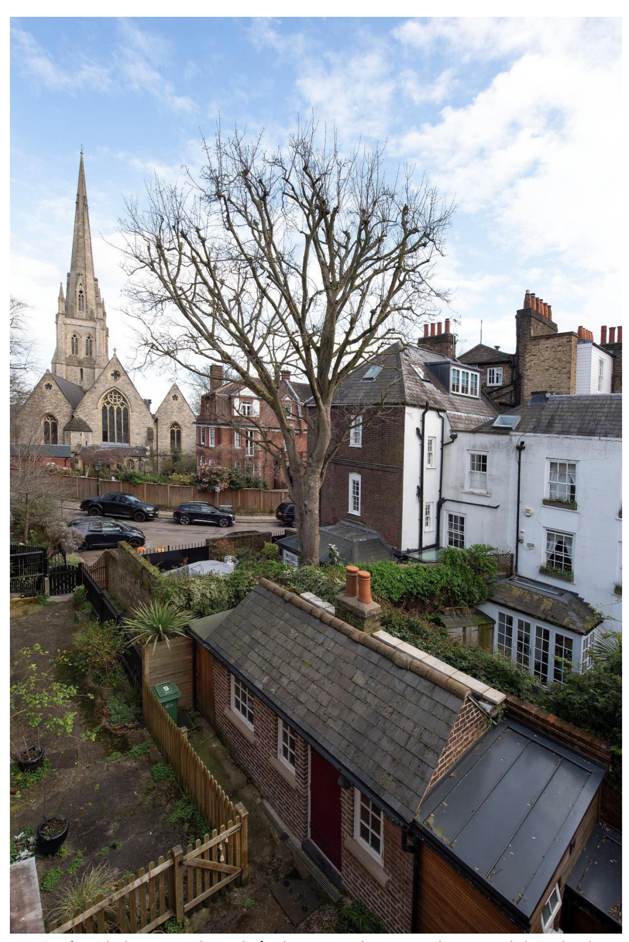
View from the house over the Studio/Bedroom towards Hampstead Square and Christ Church