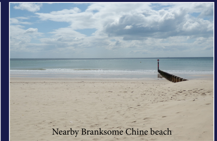
Nearby Branksome Chine beach

The well stocked mature southeast-facing lawned rear garden also hosts a sprawling private terrace with hot tub, an ideal space for family gatherings and relaxing in.