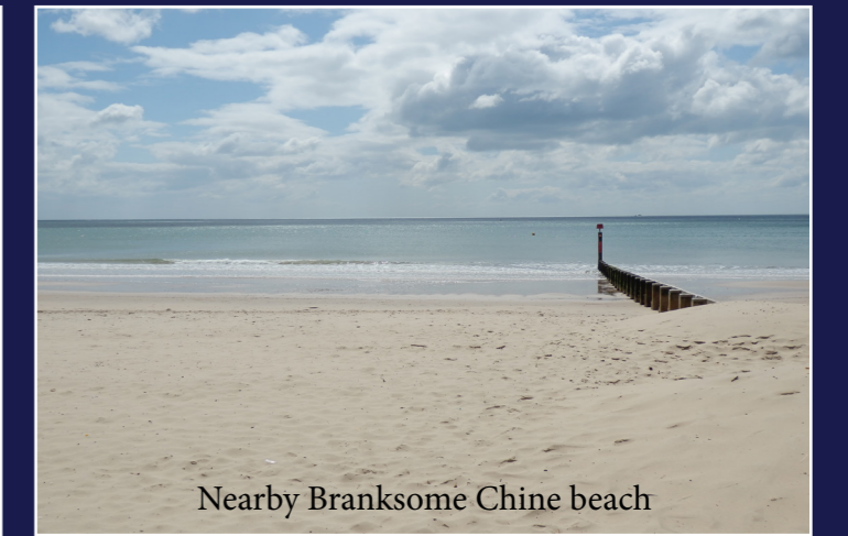
Nearby Branksome Chine beach

The well stocked mature southeast-facing lawned rear garden also hosts a sprawling private terrace with hot tub, an ideal space for family gatherings and relaxing in.