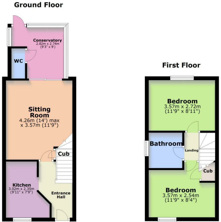
The floor plan is intended as a guide only. Plan produced using PlanUp.