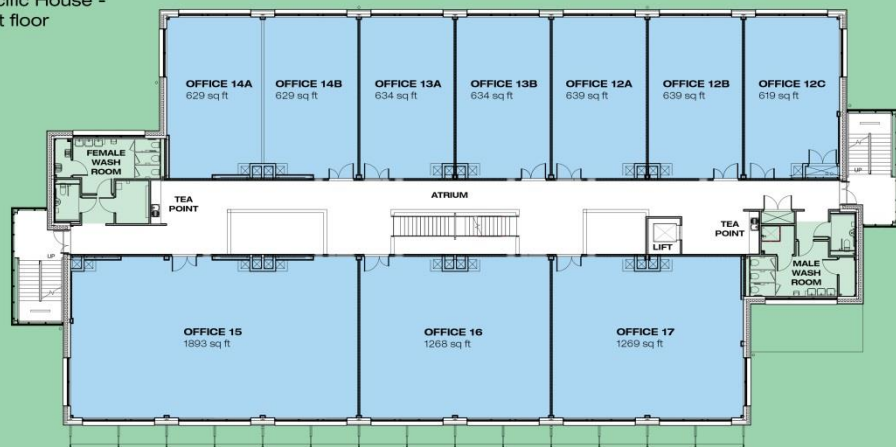
Pacific House - first floor