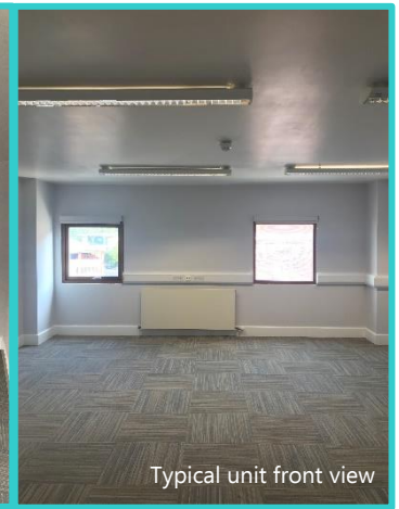
Typical unit front view