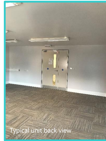
Typical unit back view

Rent and service charges are invoiced quarterly in advance and clients can opt to pay monthly by direct debit.