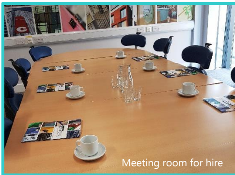
Meeting room for hire