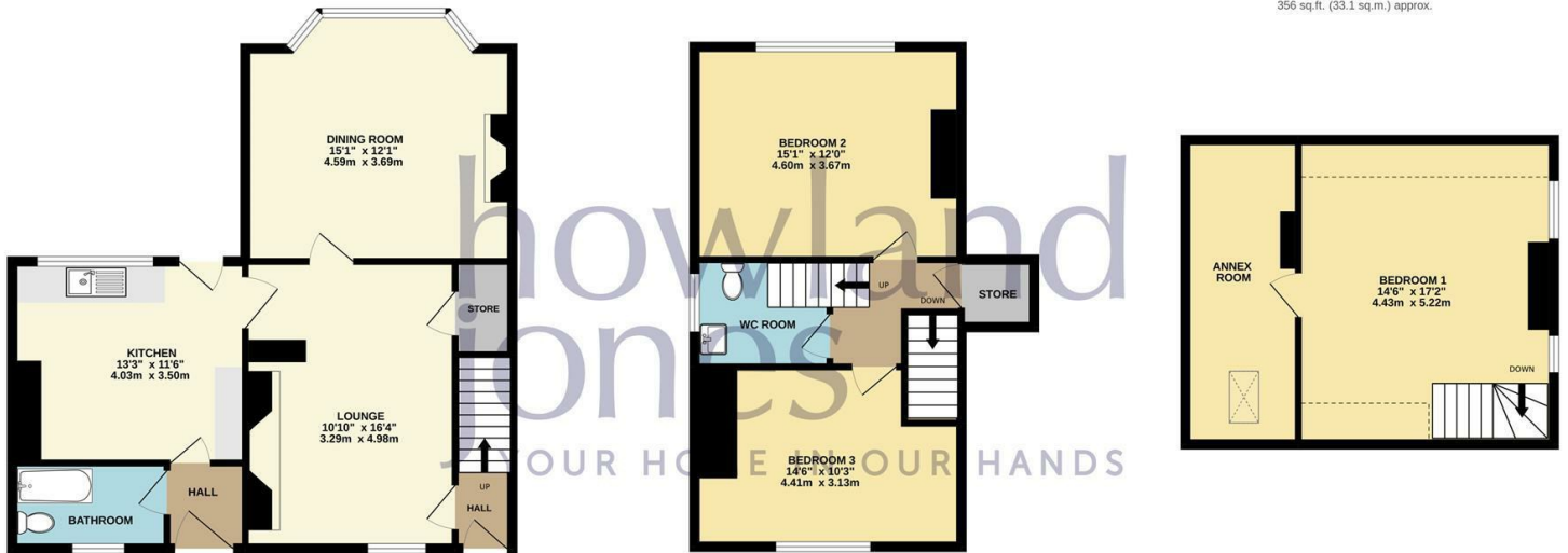
TOTAL FLOOR AREA: 1417 sq.ft. (131.6 sq.m.) approx.

Whilst every attempt has been made to ensure the accuracy of the floorplan contained here, measurements of doors, windows, rooms and any other items are approximate and no responsibility is taken for any error, omission or mis-statement. This plan is for illustrative purposes only and should be used as such by any prospective purchaser. The services, systems and appliances shown have not been tested and no guarantee as to their operability or efficiency can be given. Made with Metropix ©2022