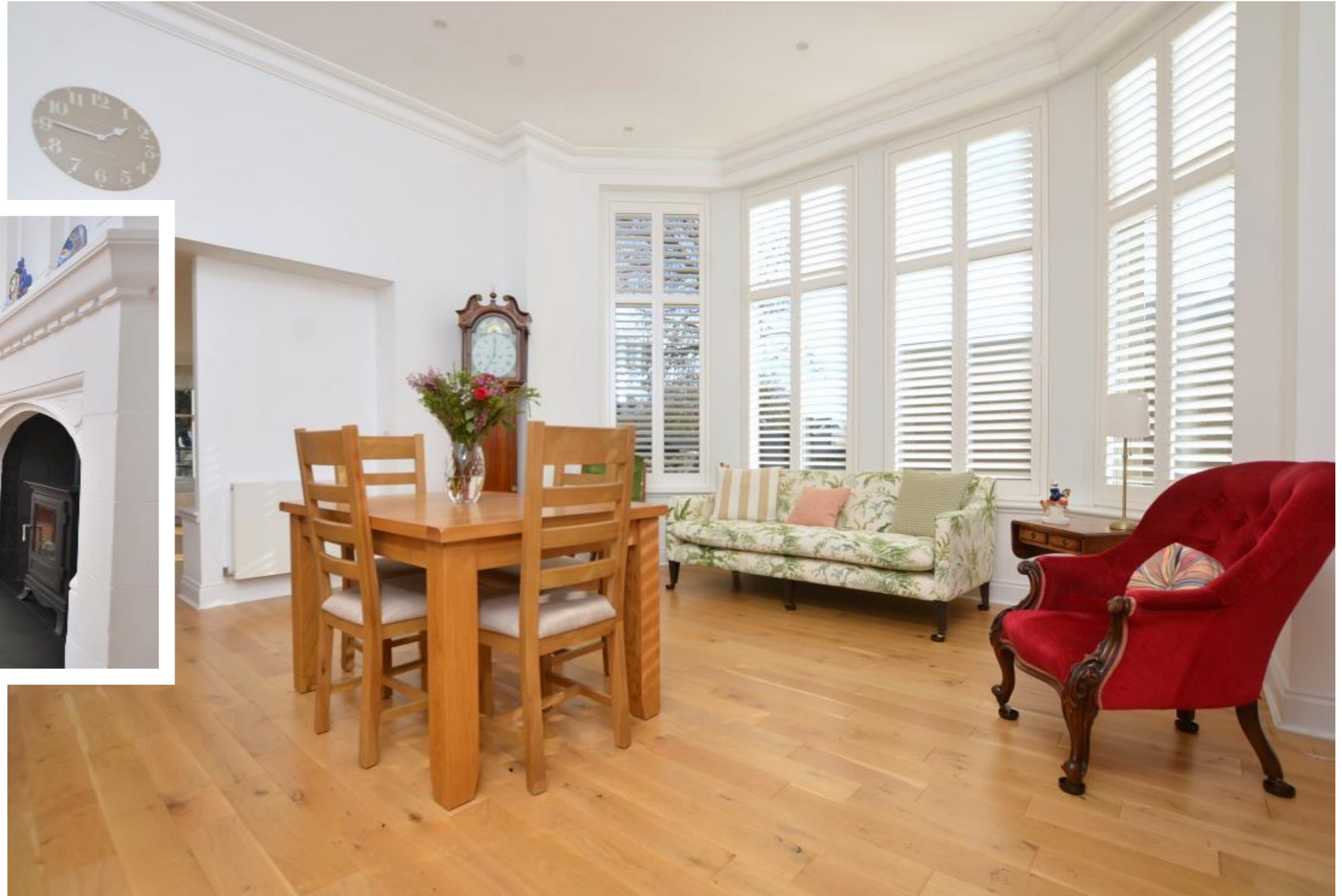
Below: Dining Area