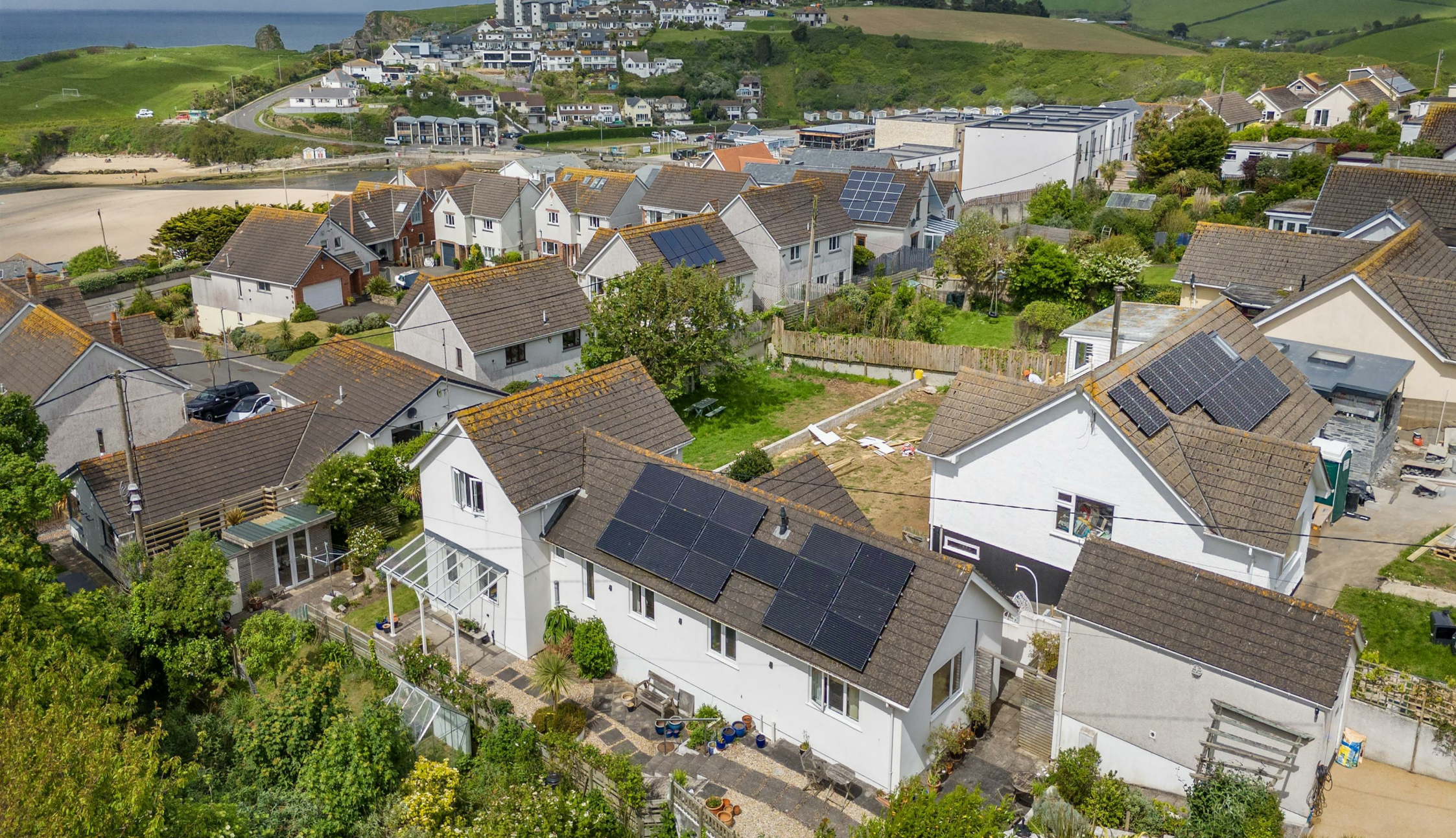
The Ridge, Porth Parade, Newquay, TR7 3JZ