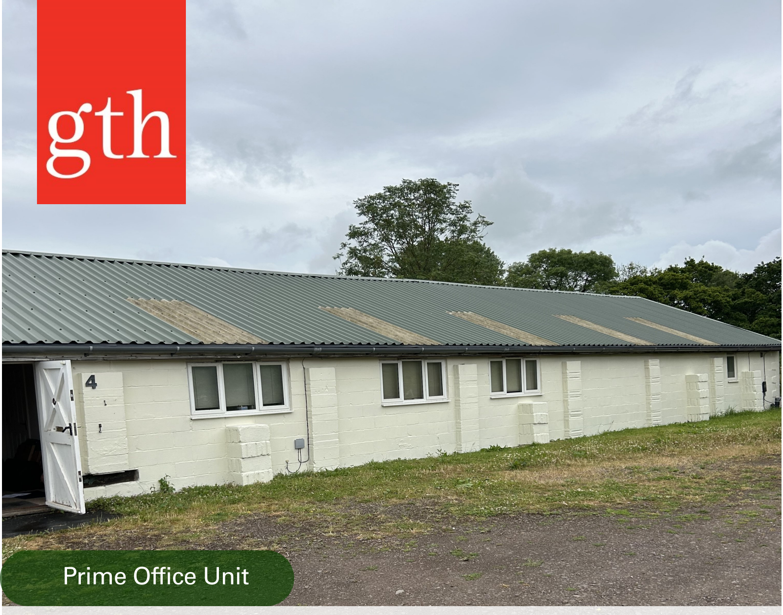
Rural Office & Workshop / Store Unit