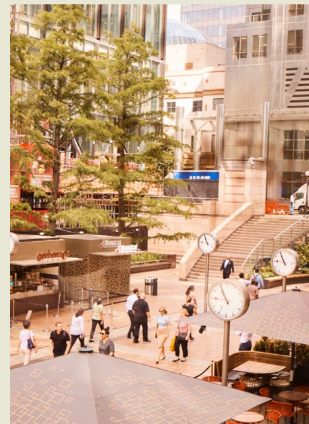
Six Public Clocks by Konstantin Grcic in Reuters Plaza

And if you're one of the 120,000 who work in the area – enjoy the blissfully easy commute.