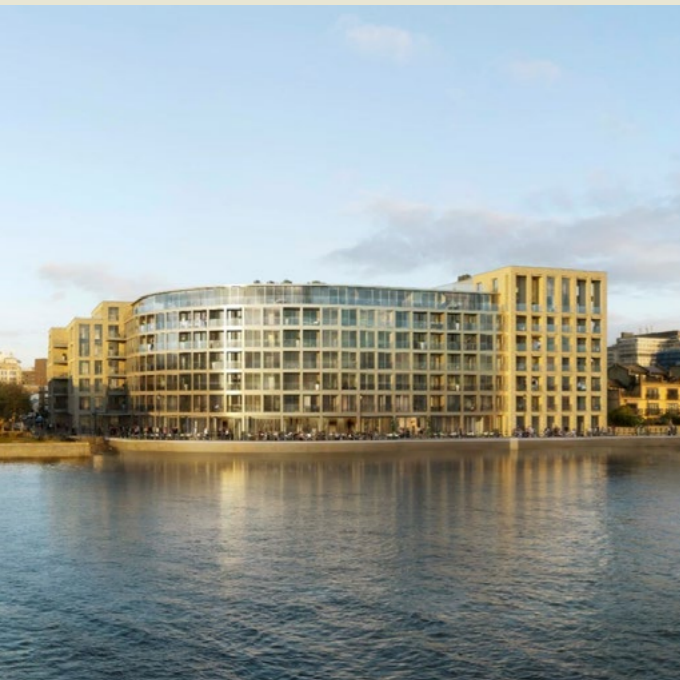
QUEEN'S WHARF, W6

Here we set out what quality means to us, going above industry standards with each of our teams.