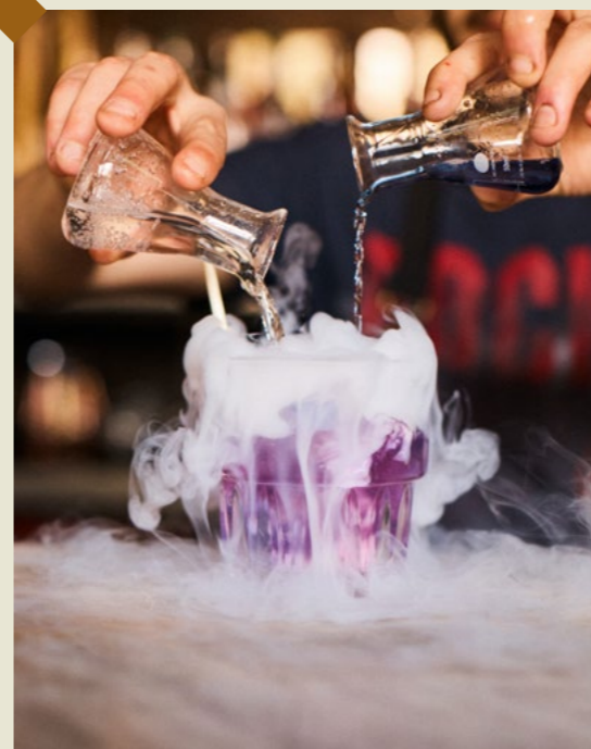
Enjoy a zingy cocktail at The Alchemist