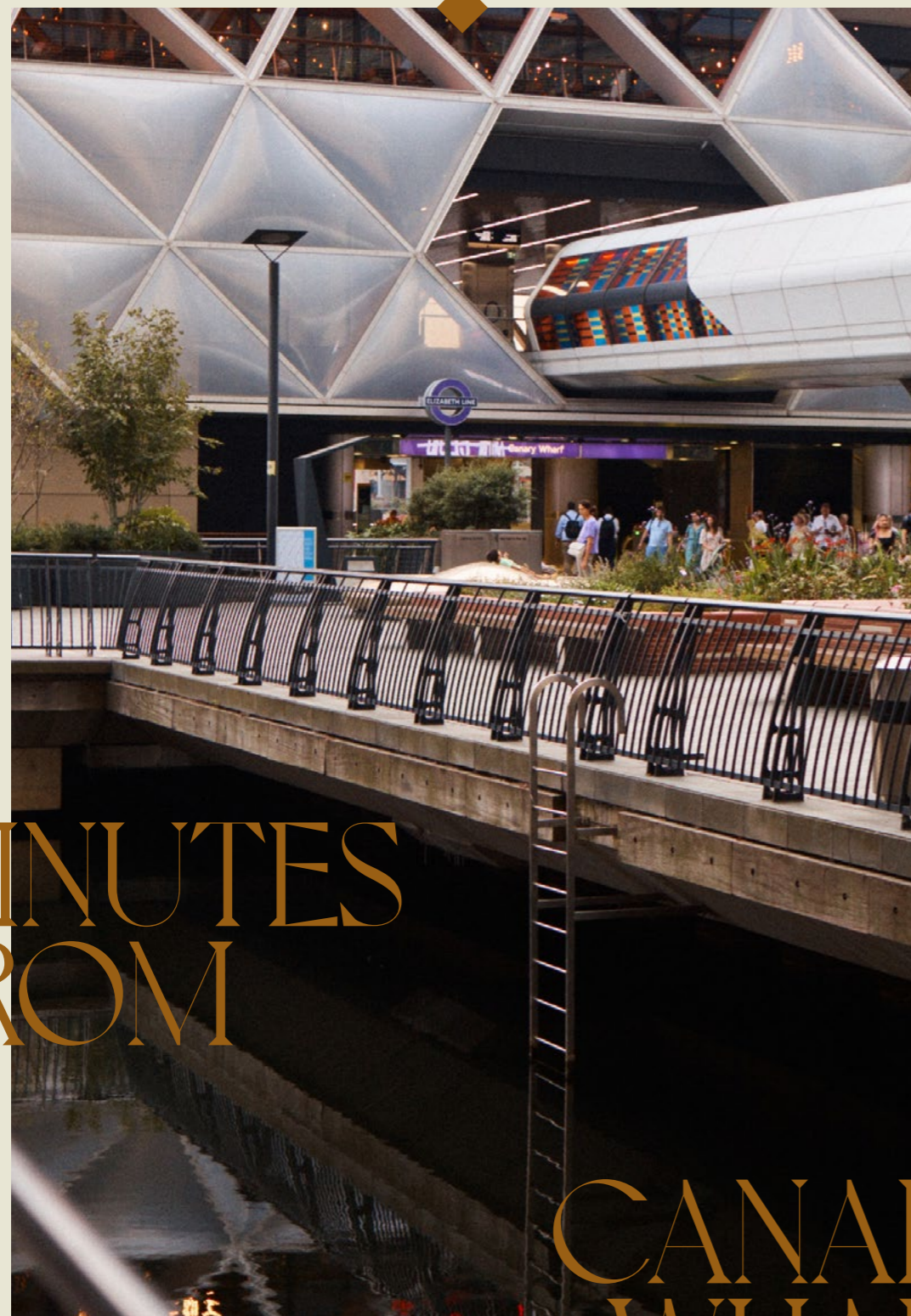
CROSSRAIL PLACE Canary Wharf's iconic Elizabeth line station

Zip along the Elizabeth line to reach London's leading financial district in 3-minutes . Or take a short stroll along the riverside.