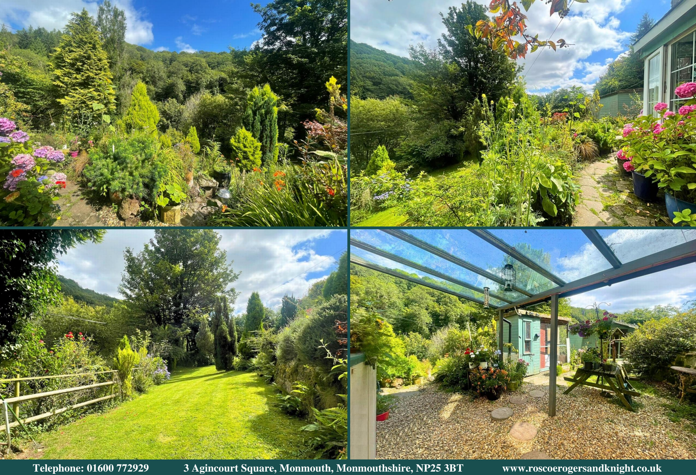
3 Agincourt Square, Monmouth, Monmouthshire, NP25 3BT