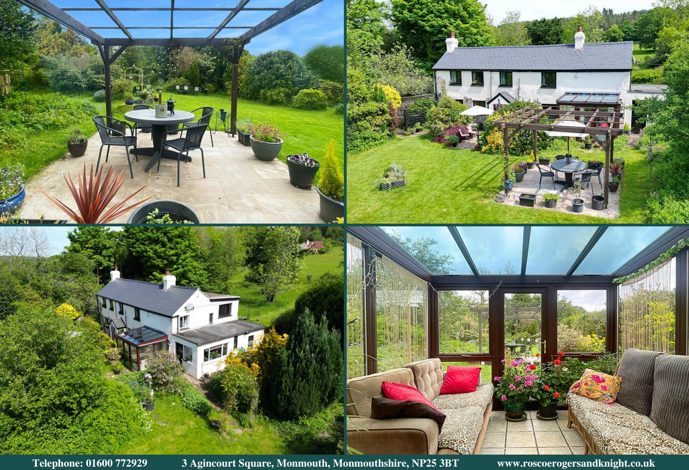
3 Agincourt Square, Monmouth, Monmouthshire, NP25 3BT