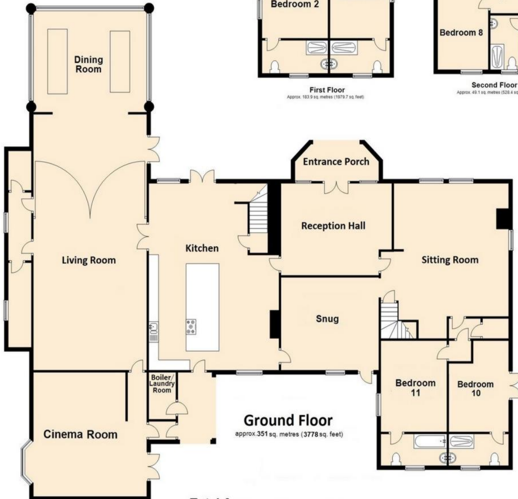
Ground Floor approx. 351 sq. metres (3778 sq. feet)