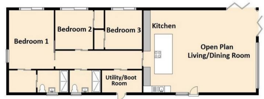
Ground Floor Approx. 577.1 sq. metres (6212.0 sq. feet)