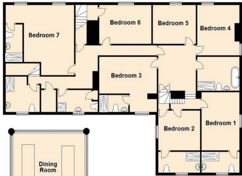
First Floor Approx. 183.9 sq. metres (1979.7 sq. feet)