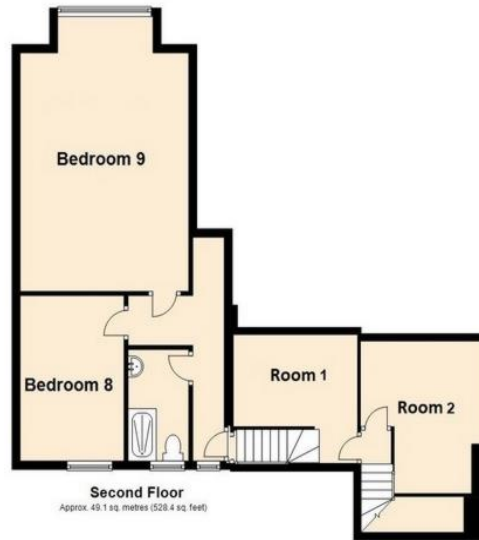
Second Floor Approx. 49.1 sq. metres (528.4 sq. feet)