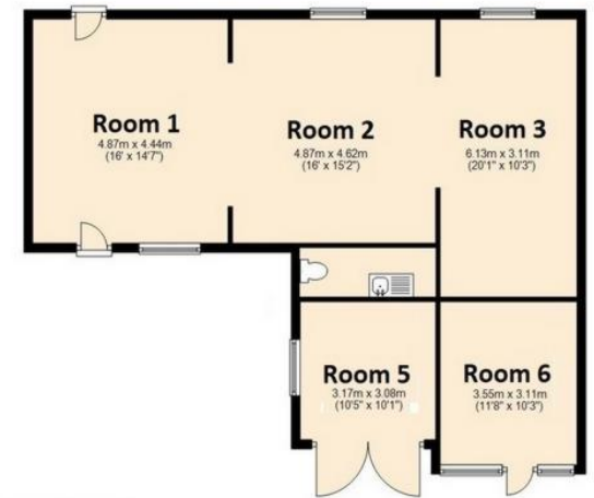
Third Floor Attic Rooms