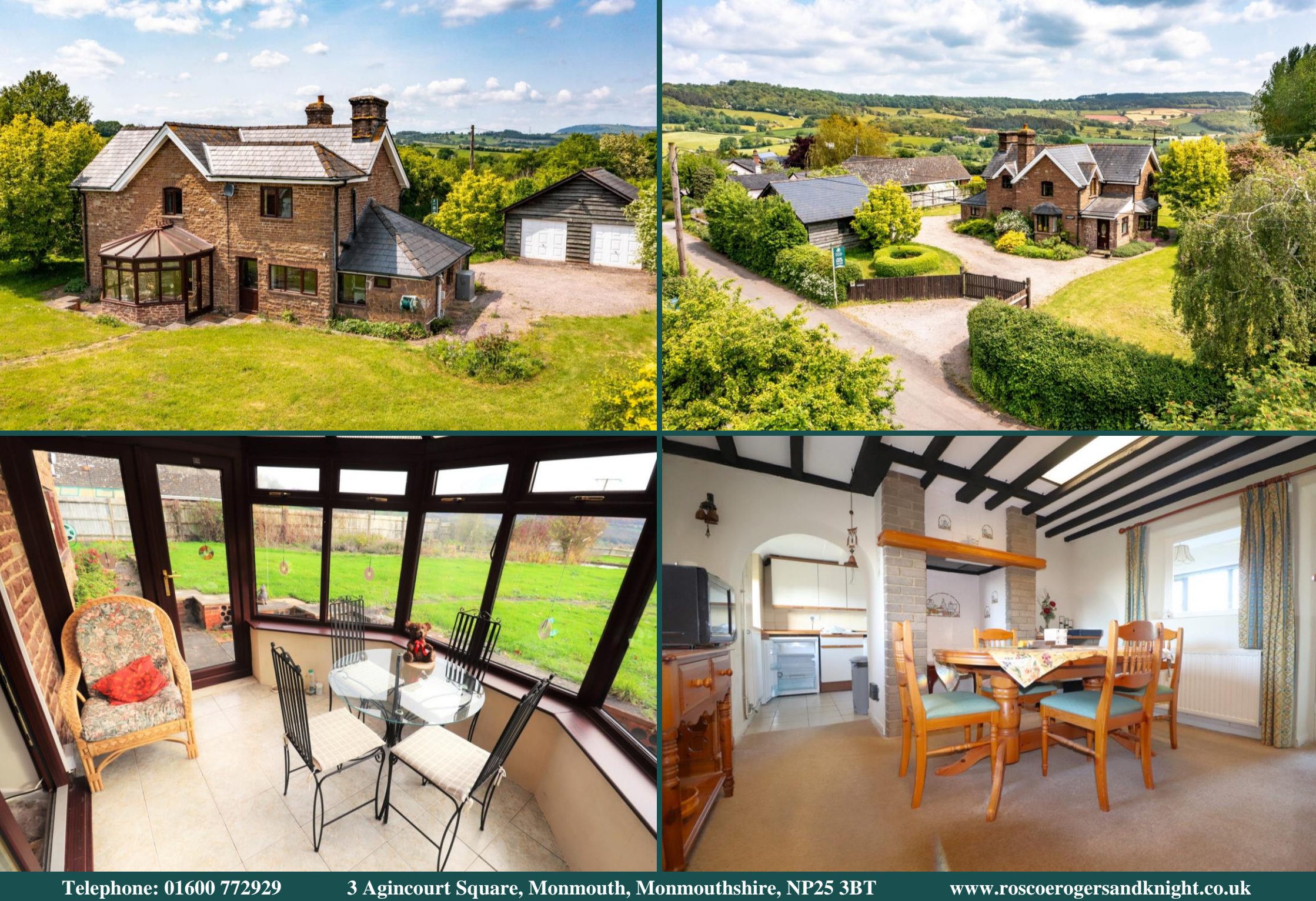
3 Agincourt Square, Monmouth, Monmouthshire, NP25 3BT