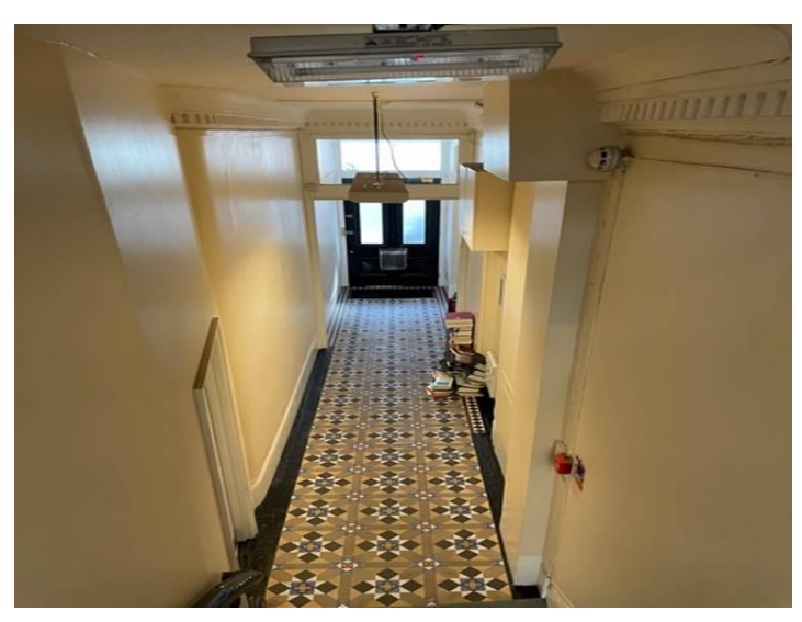
Viewings by arrangement through sole agents Noble Harris: -