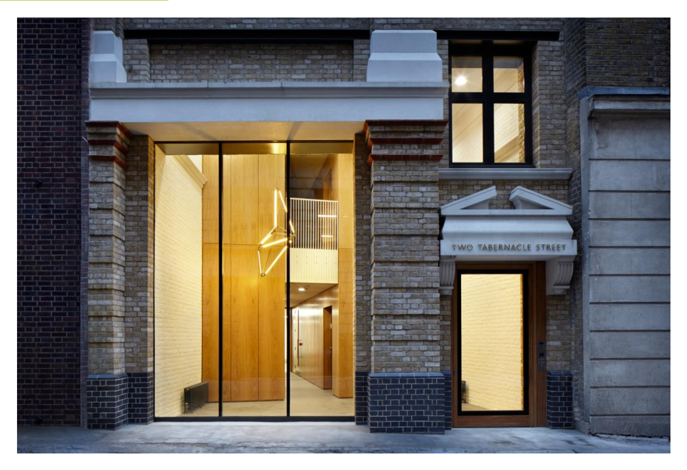
11,250 Sq Ft / 1,045.15 Sq M