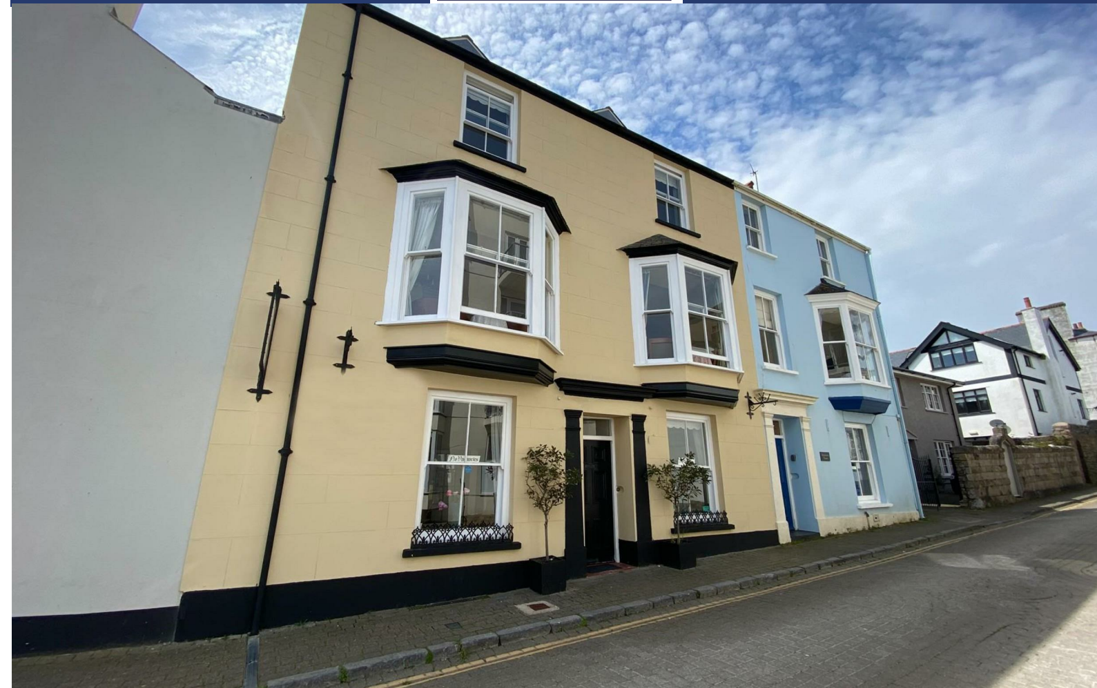
Myrtle House Hotel St. Marys Street, Tenby, Pembrokeshire, SA70 7HW