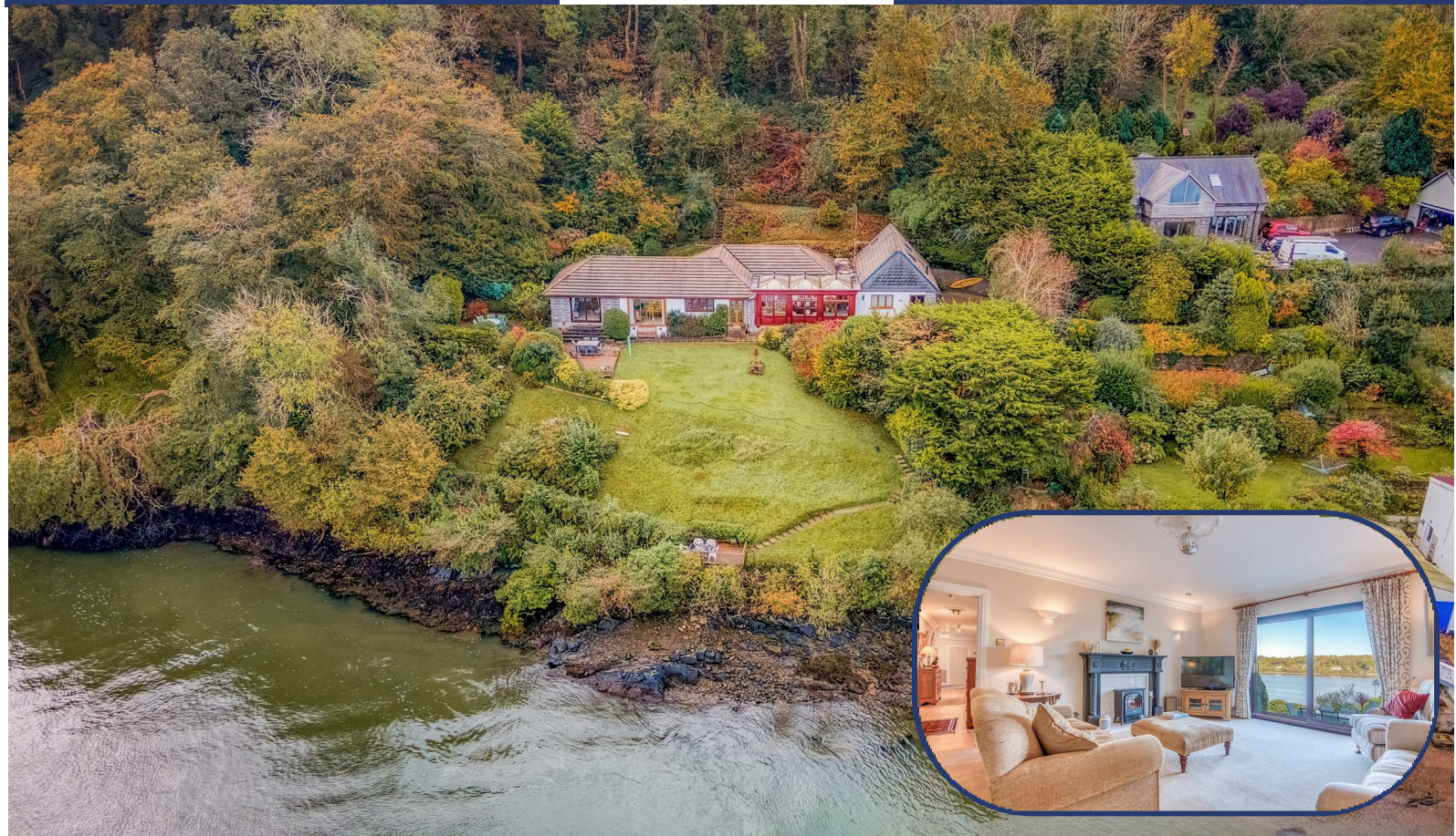
Ferry Wood House Pembroke Ferry, Pembroke Dock, Pembrokeshire, SA72 6UD