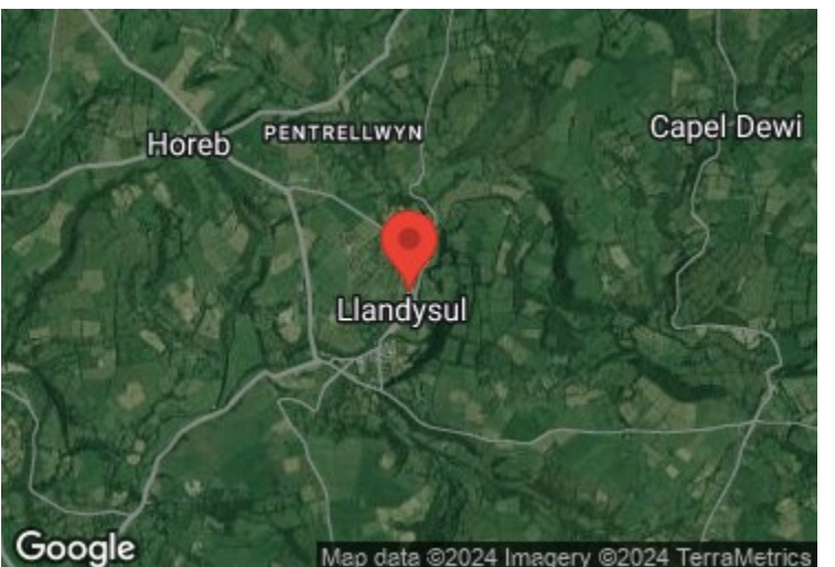
WhatThreeWords Reference: Chip.Blunders.Certainly