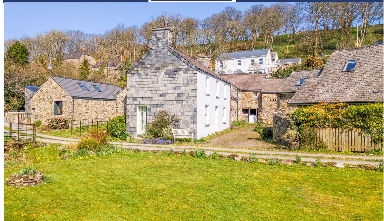
The Corn Mill & Old Mill Middle Mill, Solva, Pembrokeshire, SA62 6XD