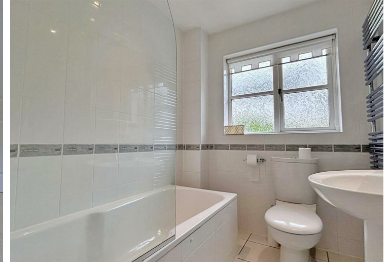
A well presented detached three bedroom house, situated on the edge of the picturesque and sought after coastal village of Little Haven. The property is ideally suited for either family use or as a holiday home, and having been successfully let out for a number of years, it has a well established repeat clientele.

The accommodation briefly comprises: porch, entrance hall, lounge, conservatory, kitchen/diner, dining room and cloakroom. First floor master bedroom with ensuite bathroom, two further bedrooms and family bathroom. Property benefits from double glazing and oil central heating.