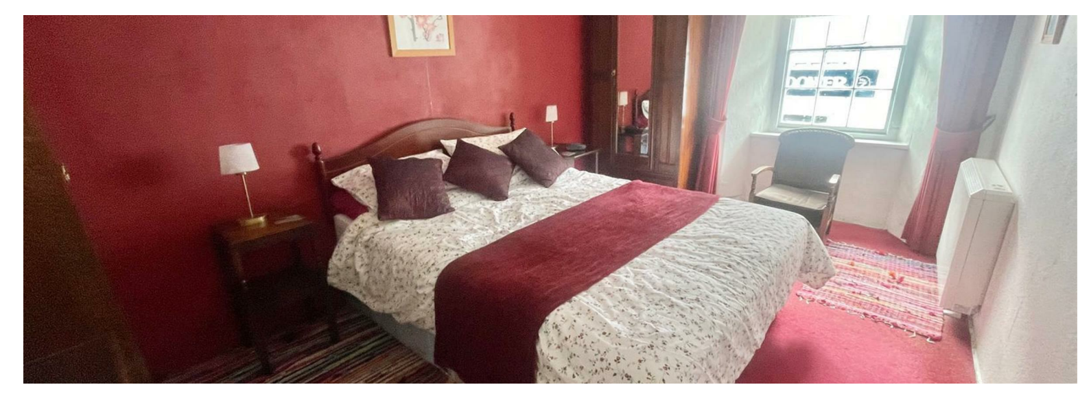
A charming period Grade 2 listed stone cottage with character features and no onward chain. Enjoying a central location in the heart of the popular Cathedral City of St Davids.

The accommodation briefly comprises of hallway, lounge with character fireplace and stone walls, kitchen/diner. Staircase leads to the first floor with two bedrooms and a family bathroom with period wood panelled walls. Property benefits from electric heating and traditional sash windows.