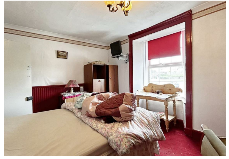
FOR SALE BY AUCTION - STARTING SOON

In need of modernisation this mid-terrace house built in 1750 and extended in 1981 has a generous amount of square footage, the potential for this property is truly limitless, whether you dream of creating a boutique bed and breakfast, a charming guest house, or simply a spacious family home, this property can accommodate your vision.