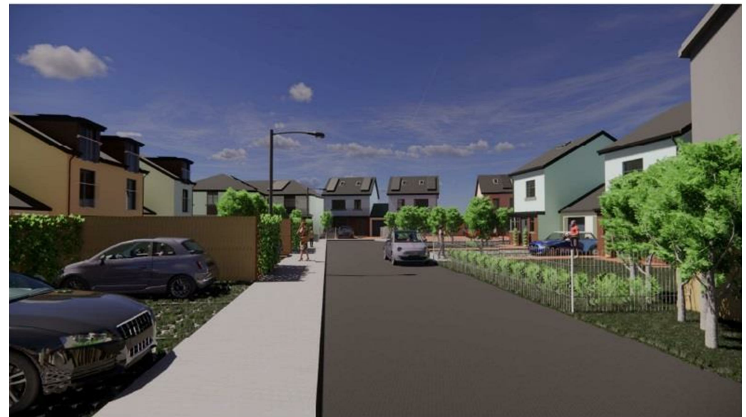
Proposed Inner Site Visual 1 1:2