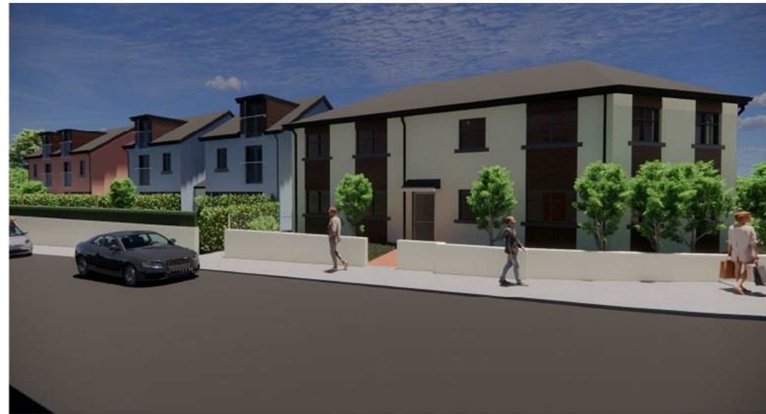
Proposed Snowdrop Lane Visual 2