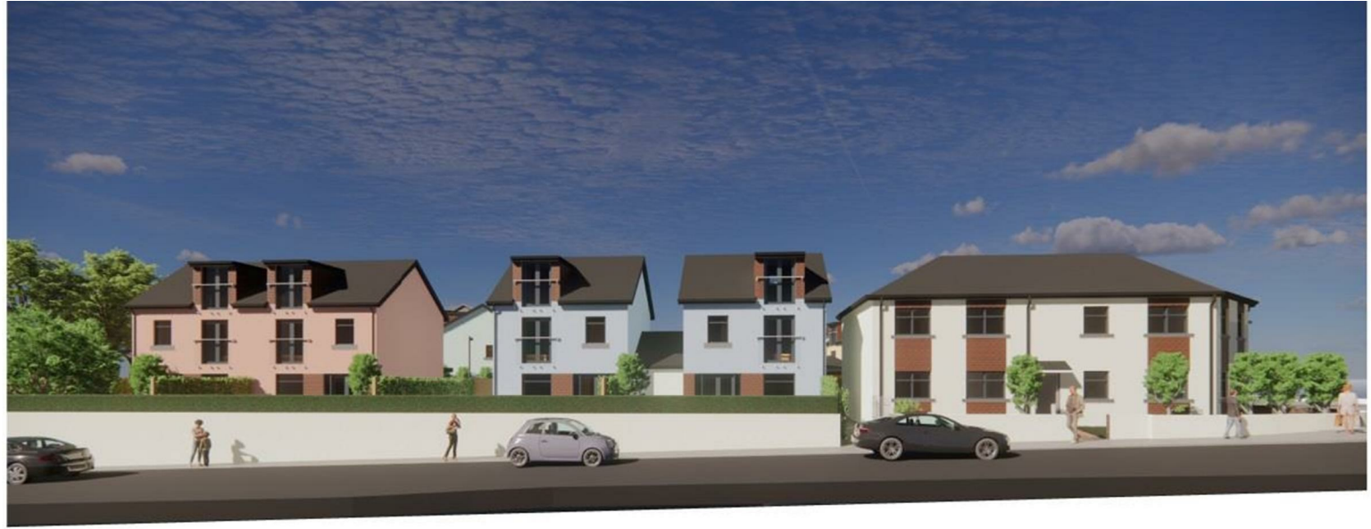
Snowdrop Lane Street Scene NTS