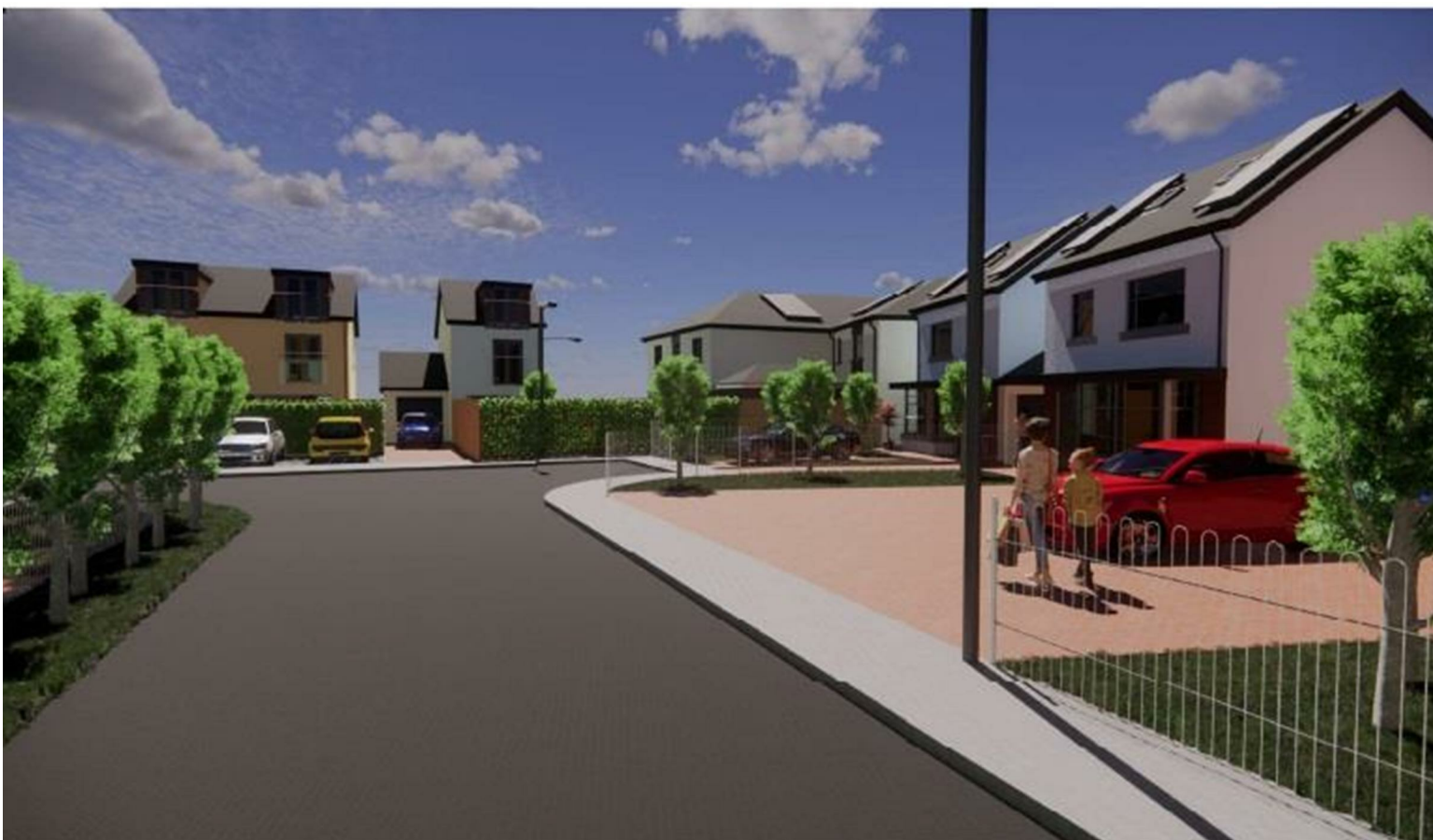
Proposed Inner Site Visual 2 1 : 2