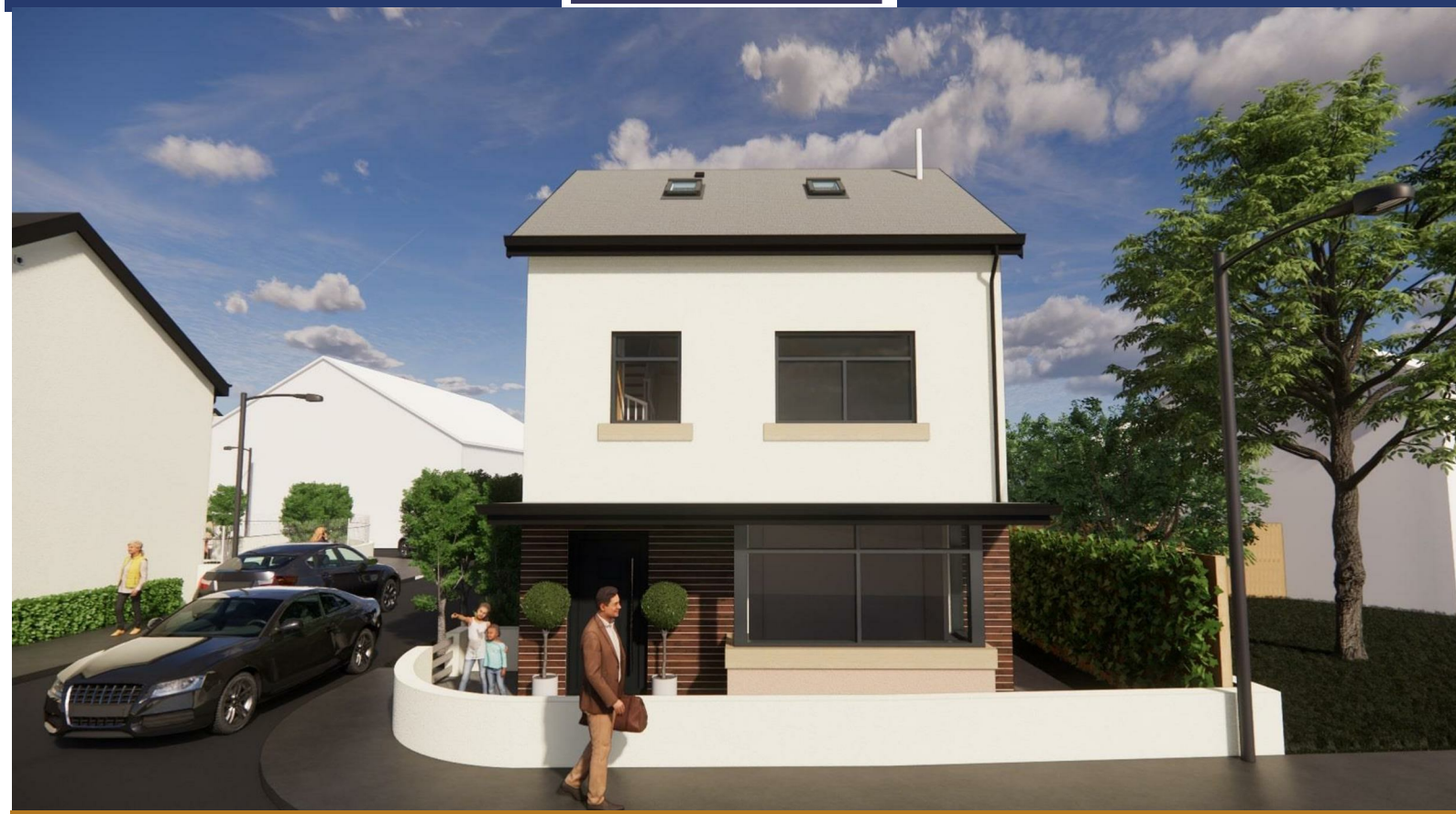
Cherry Close Plot 1, Portfield View, Portfield, Haverfordwest SA61 1DY