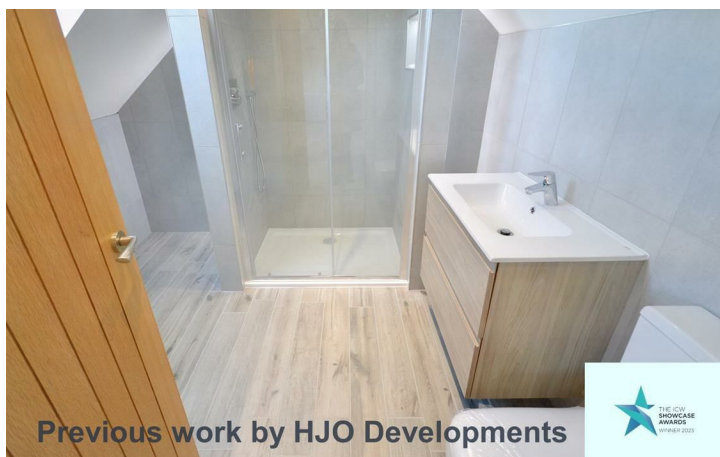
Previous work by HJO Developments