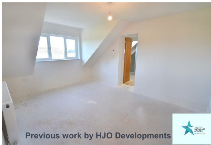
Previous work by HJO Developments

See our website www.westwalesproperties.co.uk in our TV channel to view our location videos about the area.