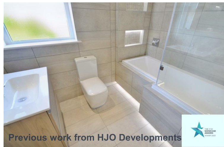
Previous work from HJO Developments