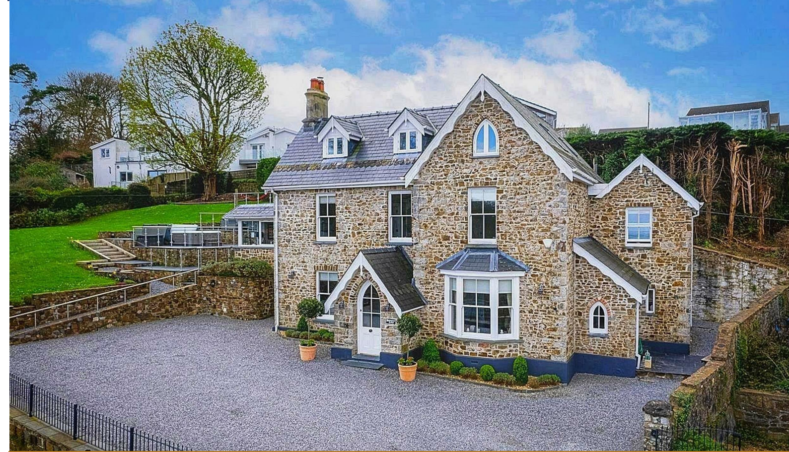
Rhodewood Lodge St. Brides Hill, Saundersfoot, Pembrokeshire, SA69 9NU

WE WOULD LIKE TO POINT OUT THAT OUR PHOTOGRAPHS ARE TAKEN WITH A DIGITAL CAMERA WITH A WIDE ANGLE LENS. These particulars have been prepared in all good faith to give a fair overall view of the property. If there is any point which is of specific importance to you, please check with us first, particularly if travelling some distance to view the property. We would like to point out that the following items are excluded from the sale of the property: Fitted carpets, curtains and blinds, curtain rods and poles, light fittings, sheds, greenhouses - unless specifically specified in the sales particulars. Nothing in these particulars shall be deemed to be a statement that the property is in good structural condition or otherwise. Services, appliances and equipment referred to in the sales details have not been tested, and no warranty can therefore be given. Purchasers should satisfy themselves on such matters prior to purchase. Any areas, measurements or distances are given as a guide only and are not precise. Room sizes should not be relied upon for carpets and furnishings.