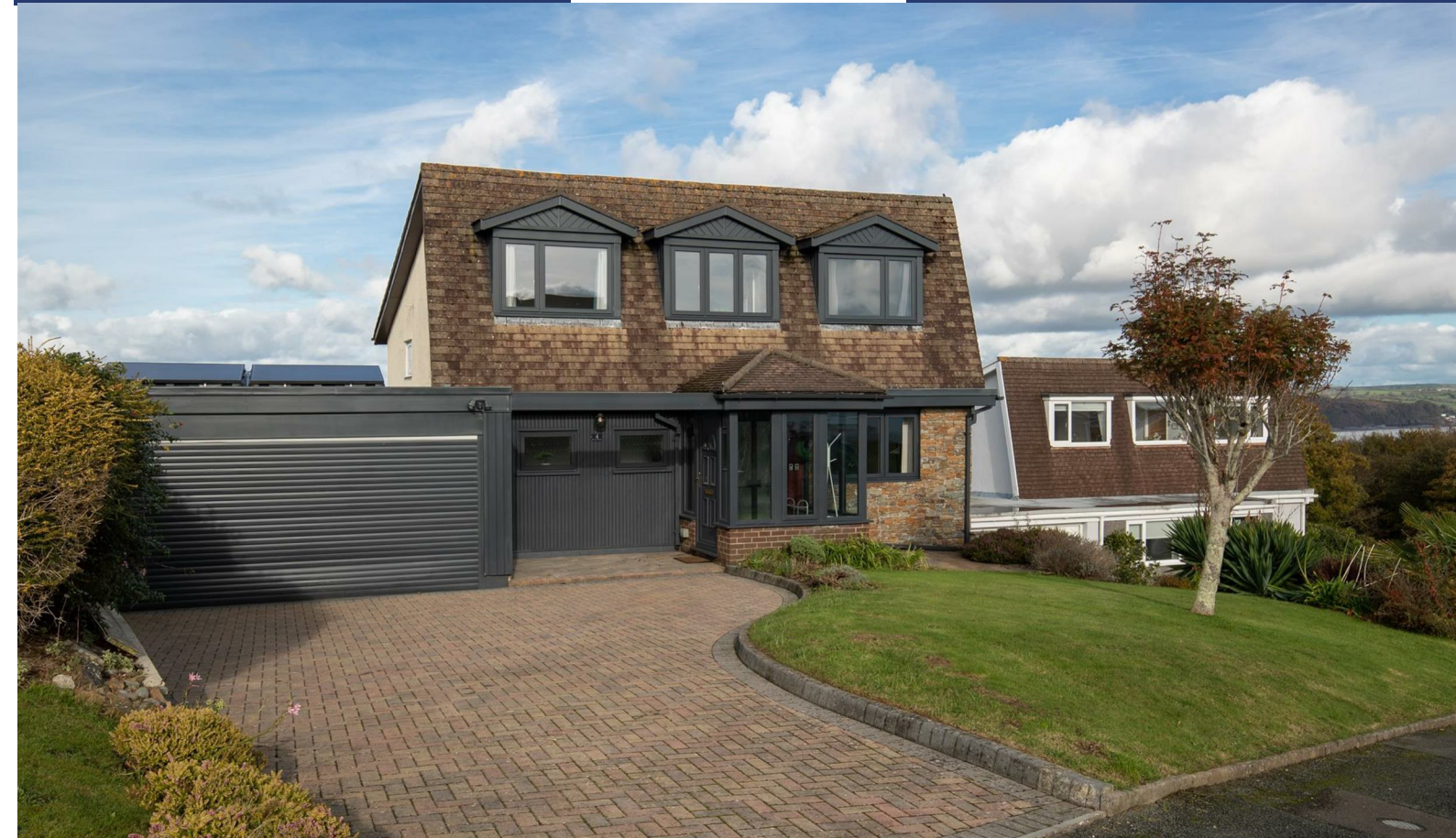
Golwg Y Mor, 4 Bevelin Hall, Saundersfoot, Pembrokeshire, SA69 9PG