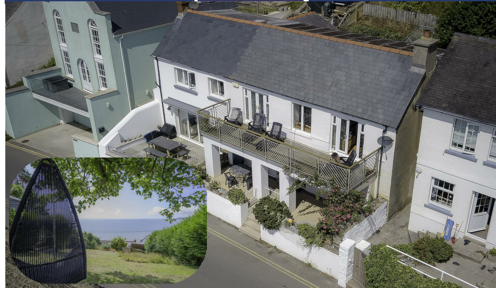
Rock House Amroth, Narberth, Pembrokeshire, SA67 8NG

This floorplan is only for illustrative purposes and is not to scale. Measurements of rooms, doors, windows, and any items are approximate and no responsibility is taken for any error, omission or mis-statement. Icons of items such as bathroom suites are representations only and may not look like the real items. Made with Made Snappy 360.