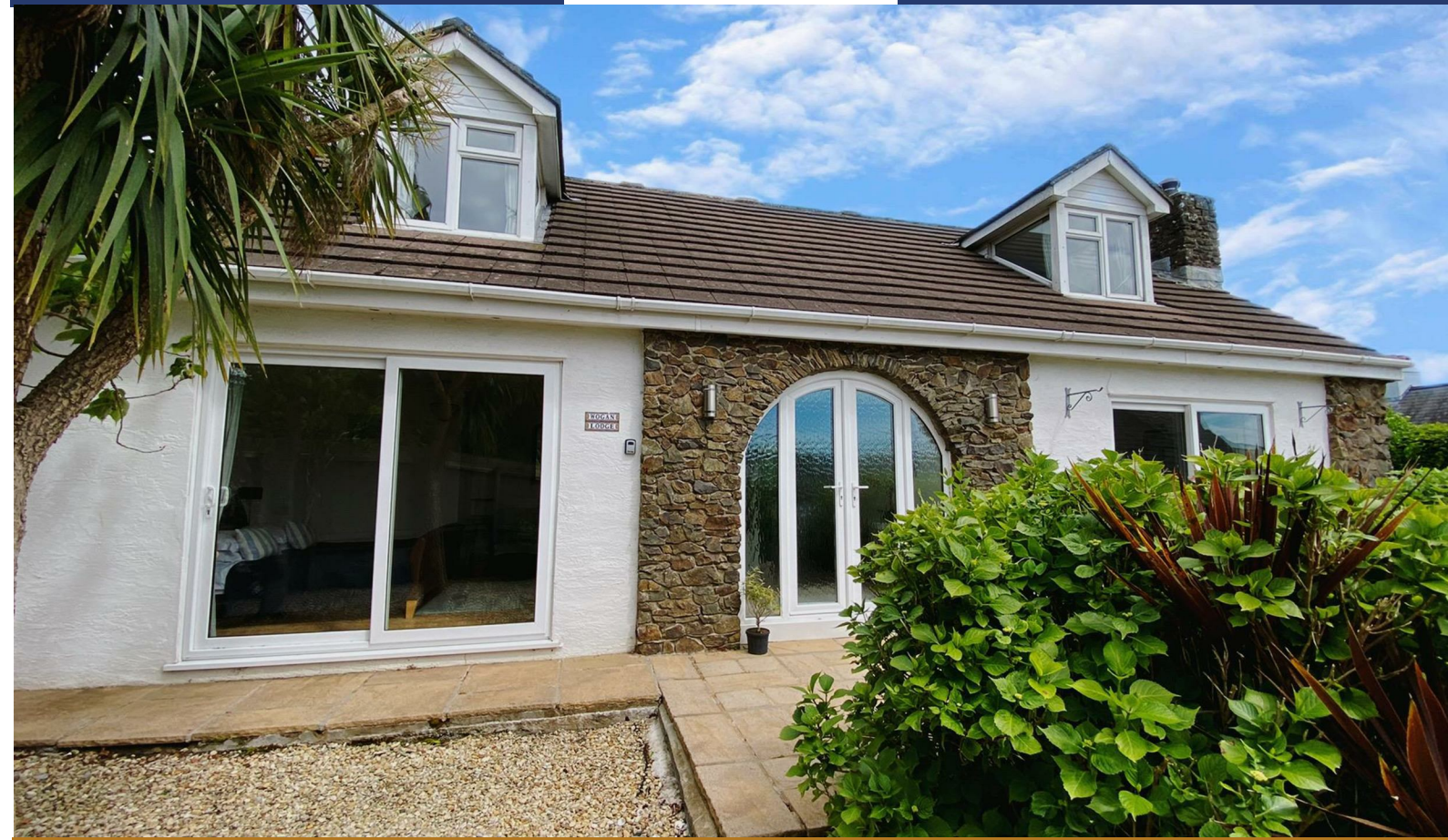
Wogan Lodge Wogan Lane, Off Wogan Terrace, Saundersfoot, Pembrokeshire SA69 9HA