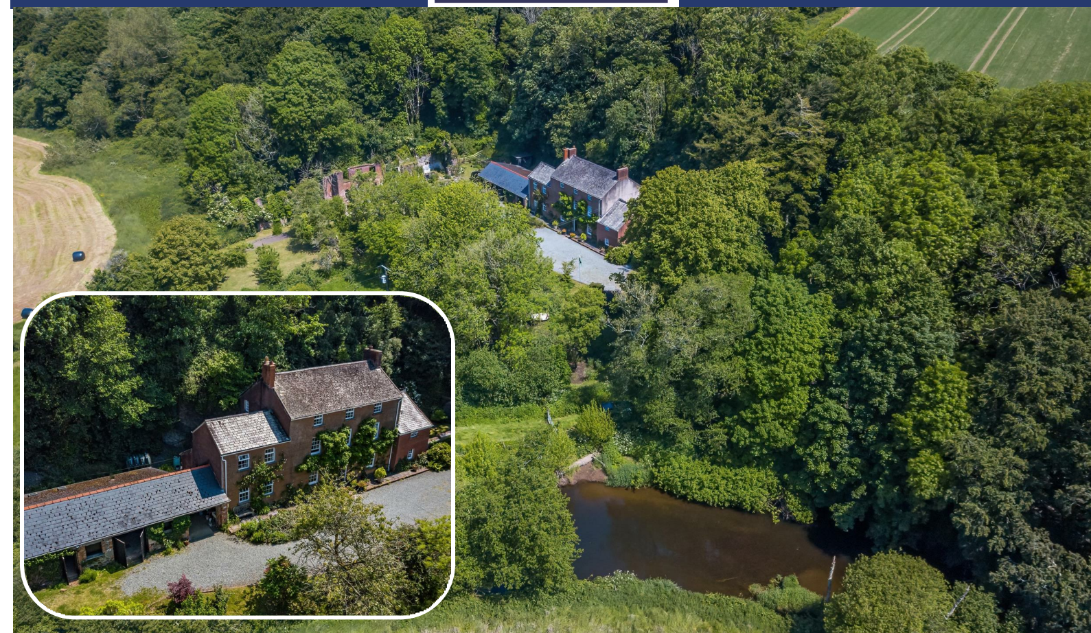
Mill House Fishguard Road, Haverfordwest, Pembrokeshire, SA62 4BP