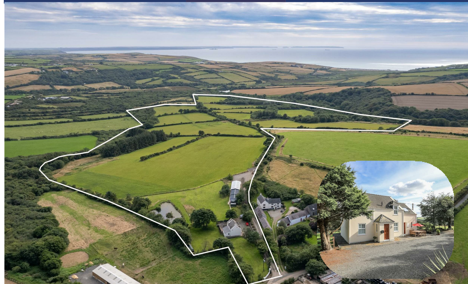
Trewen, Upper Eweston Farm Penycwm, Haverfordwest, Pembrokeshire, SA62 6JY

Total area: approx. 159.7 sq. metres (1719.1 sq. feet)