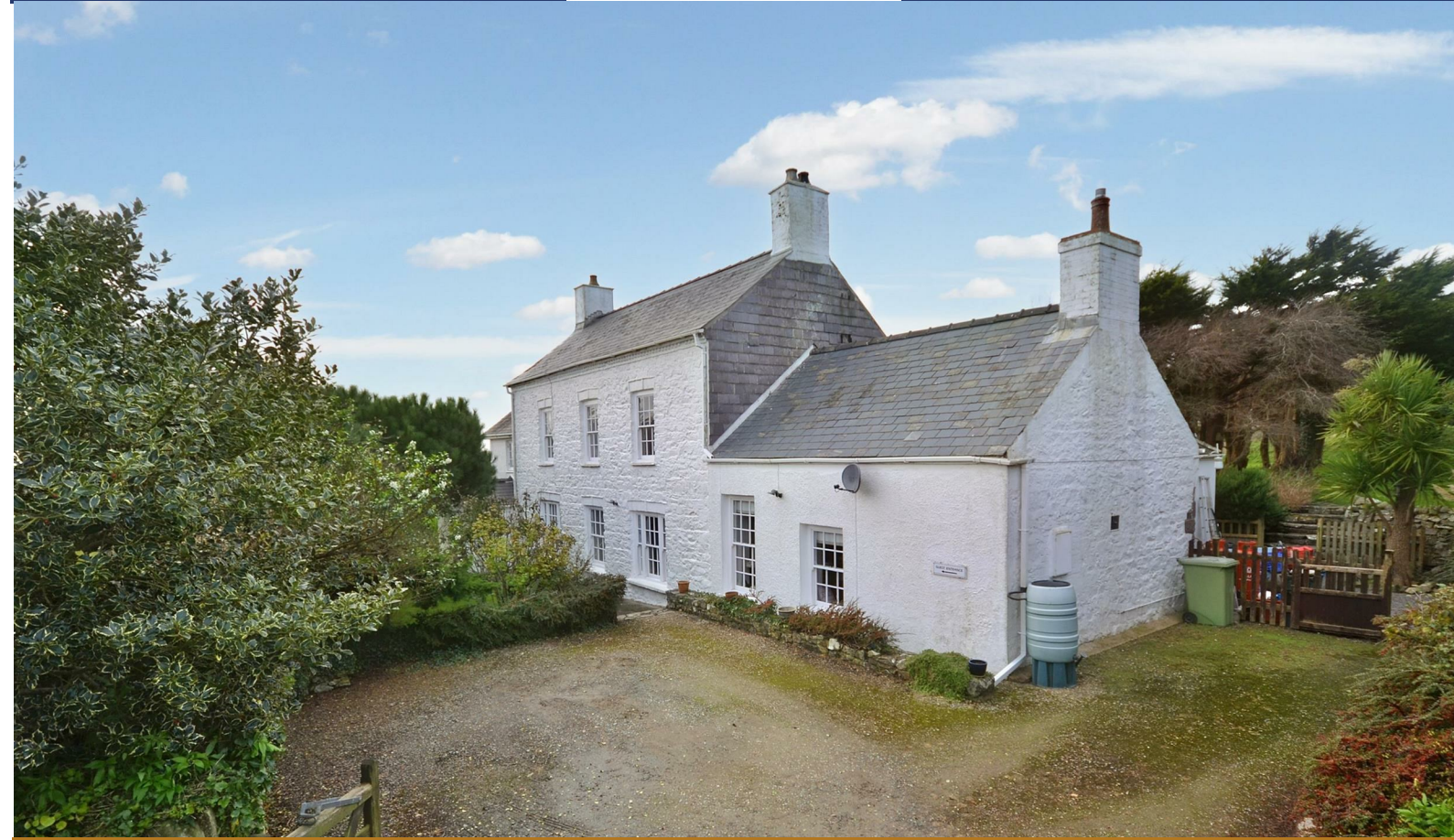
Bank House Whitchurch Road, Solva, Pembrokeshire, SA62 6TR