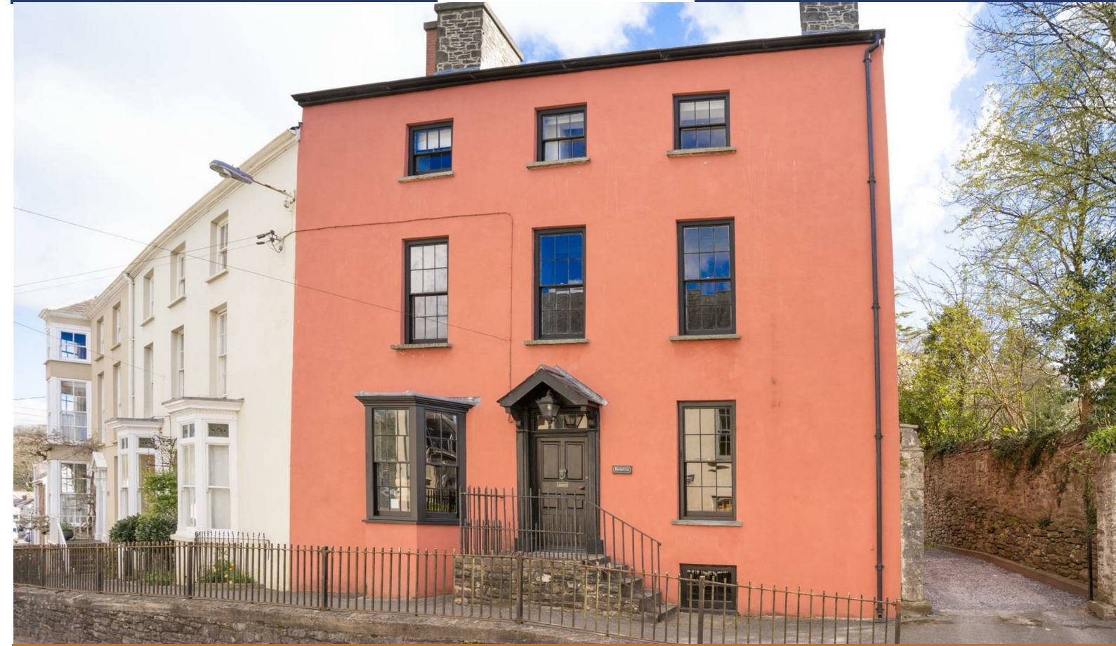
Rosetta House King Street, Laugharne, Carmarthenshire, SA33 4QE