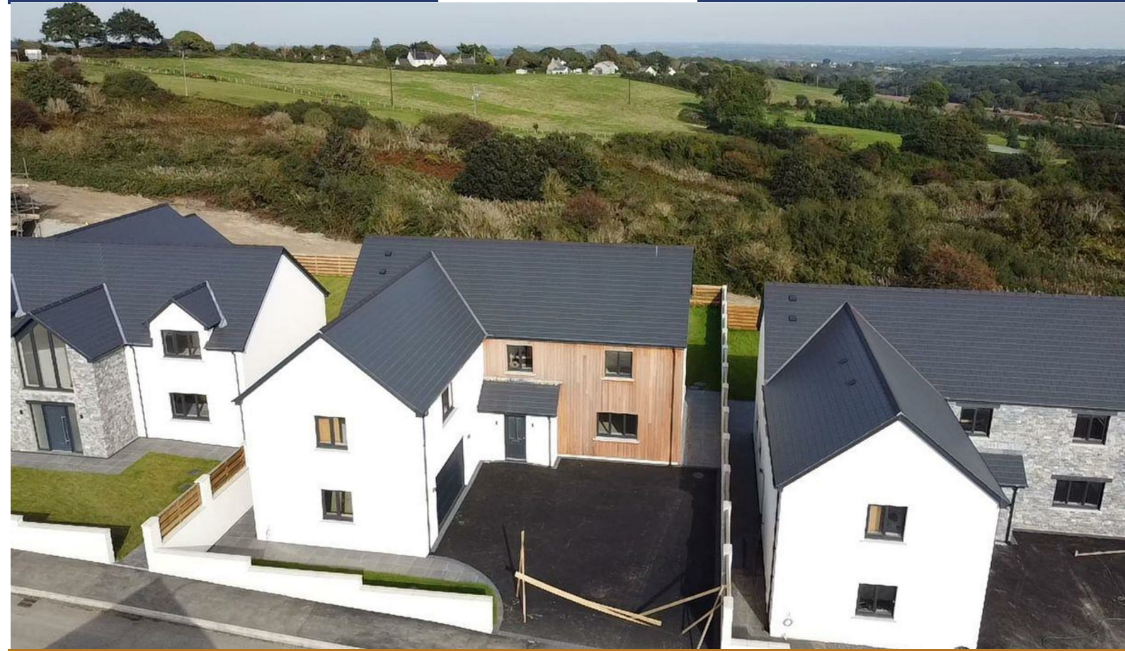
The Dale, Plot 15 Summerhill, New Road, Freystrop, Haverfordwest, Pembrokeshire, SA62 4LQ