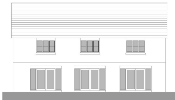
Proposed South West Elevation