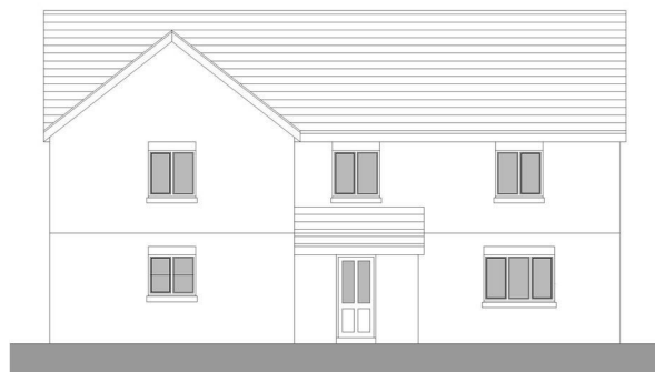
Proposed South West Elevation