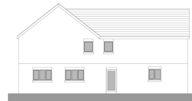
Proposed North West Elevation