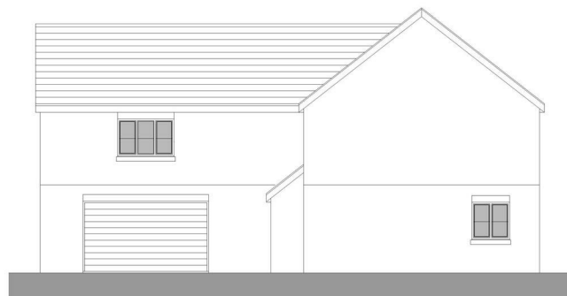
Proposed South East Elevation