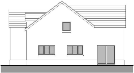
Proposed South East Elevation