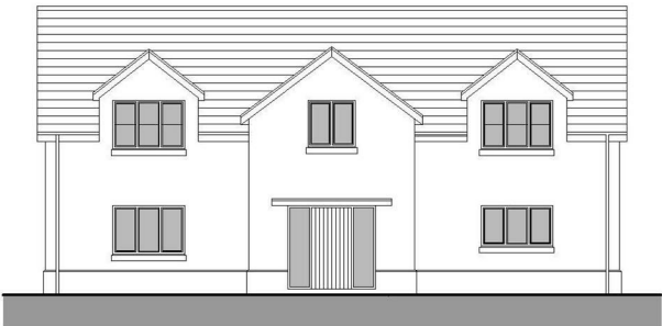
Proposed South West Elevation