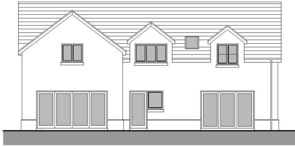
Proposed North East Elevation