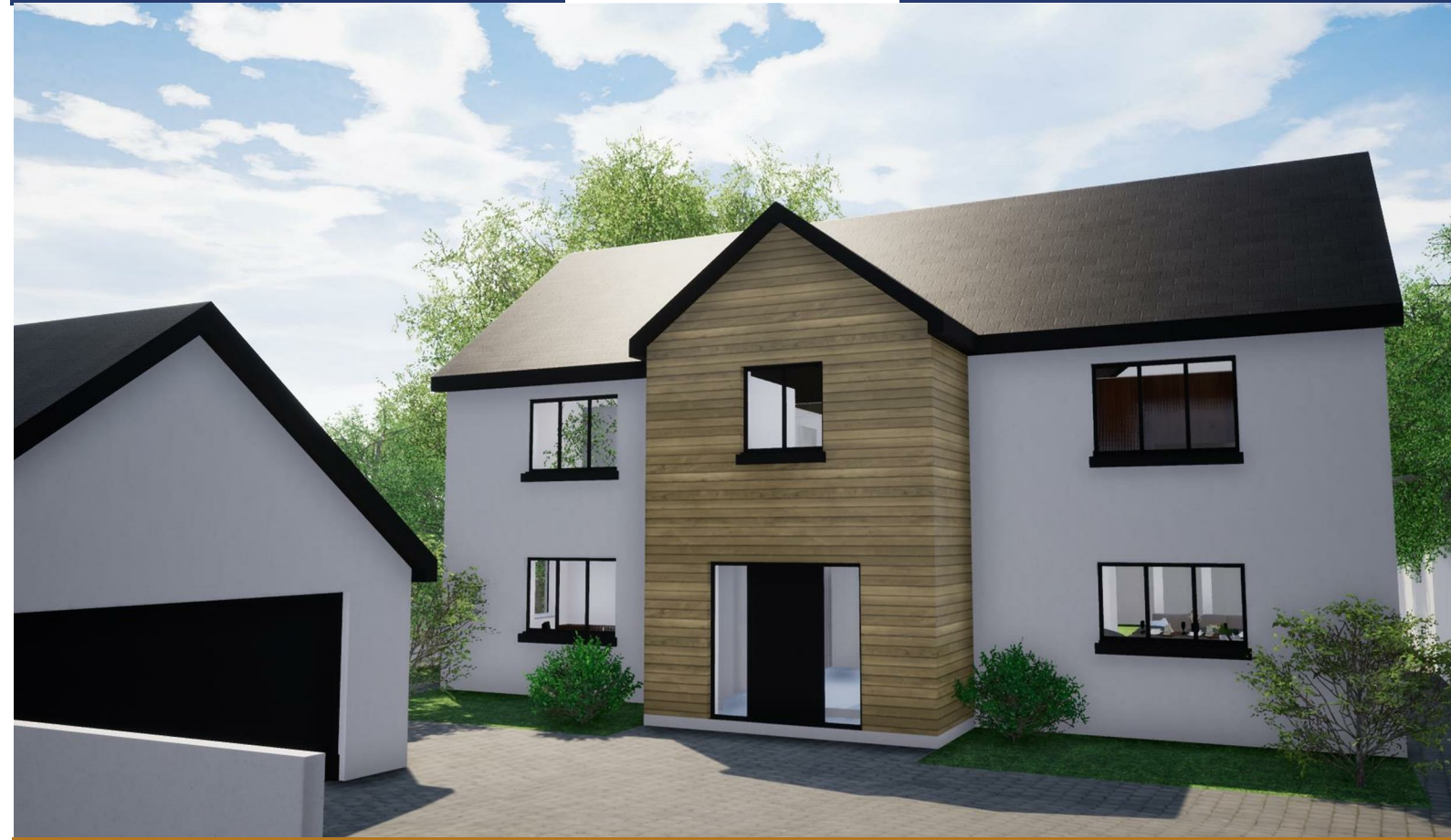
The Hook, Plot 9 Summerhill, New Road, Freystrop, Haverfordwest, Pembrokeshire, SA62 4LQ