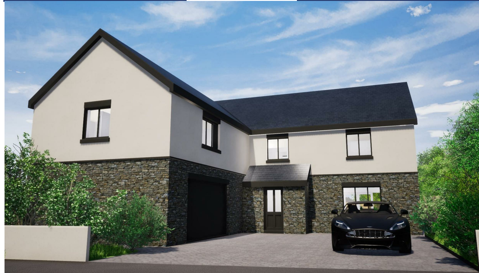
The Dale, Plot 14 Summerhill, New Road, Freystrop, Haverfordwest, Pembrokeshire, SA62 4LQ