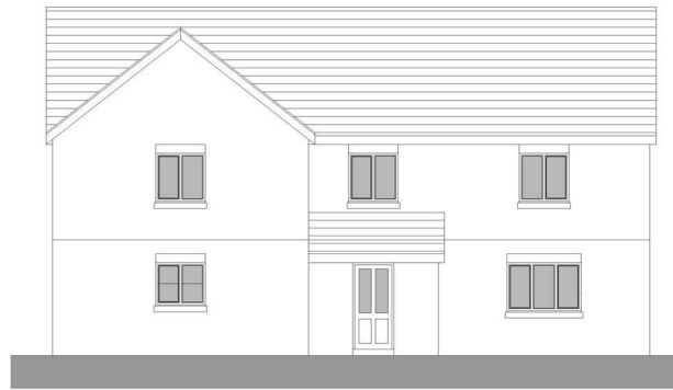
Proposed South West Elevation