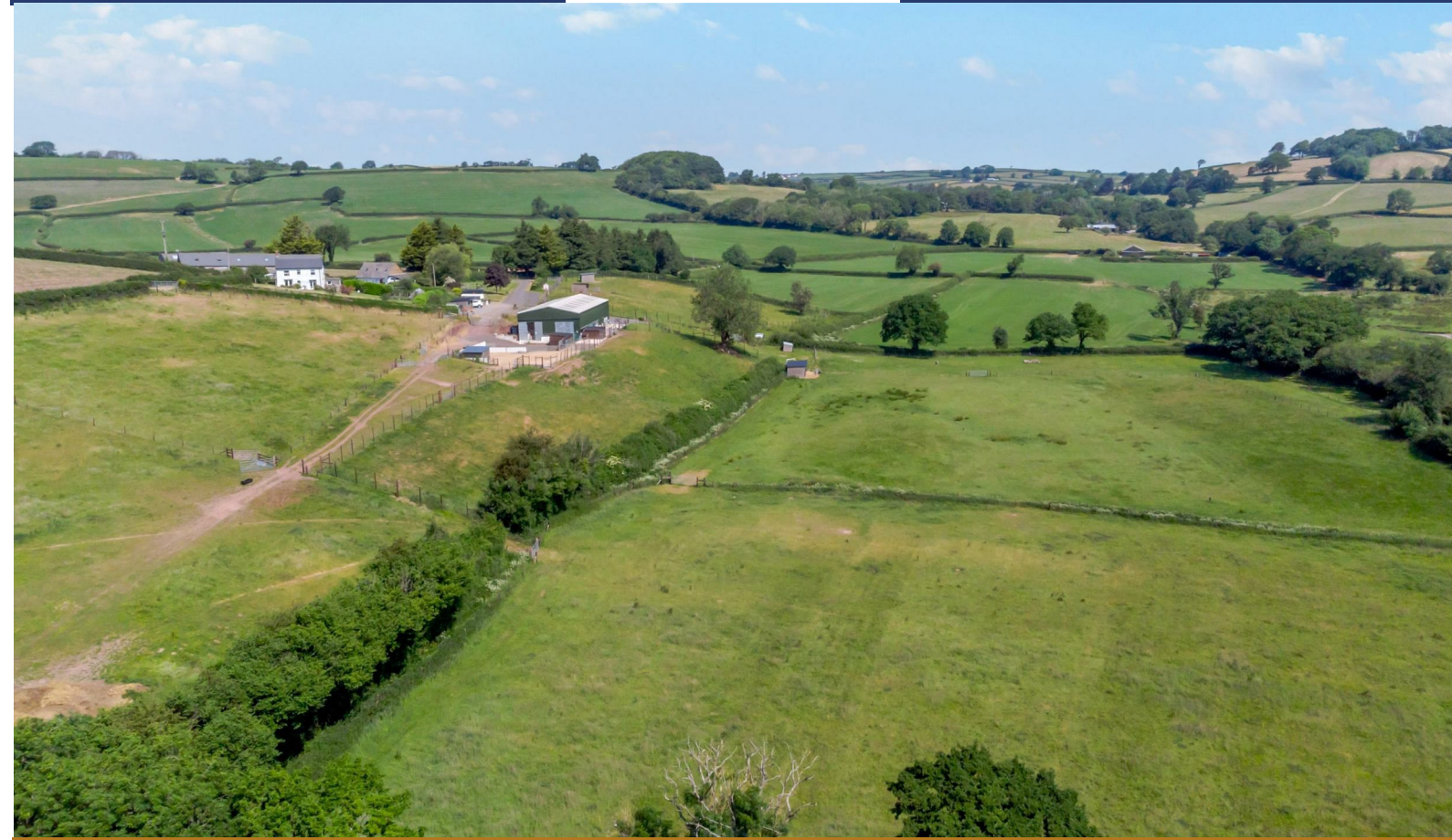
Ystradfach Farm Llandyfaelog, Kidwelly, Carmarthenshire, SA17 5NY

This document is only for illustrative purposes and is not to scale. Measurements of rooms, doors, windows, and any other area are approximate and do not include the area covered by any external structure or any other area. Measurements are given in metres and feet. All measurements are given to the nearest millimetre. Measurements are given to the nearest millimetre. Measurements are given to the nearest millimetre. Measurements are given to the nearest millimetre.