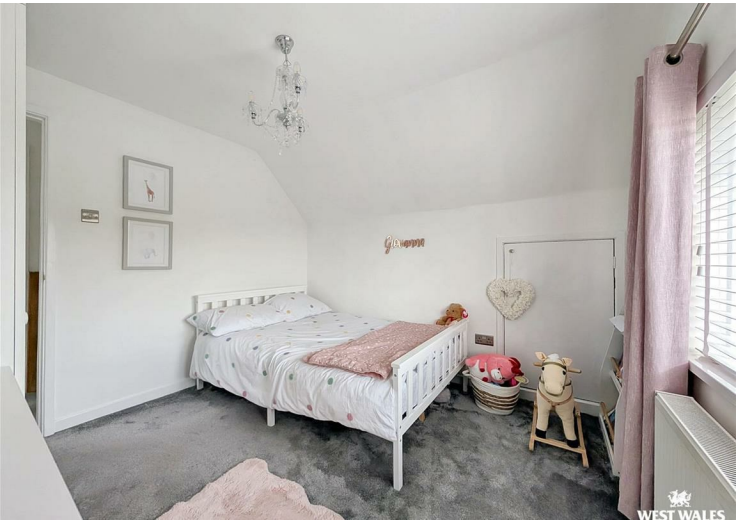
Charming Detached Dormer Bungalow in Prime Carmarthen Location

Tucked away in a cul-de-sac and just a short stroll from Carmarthen town centre, this beautifully presented detached dormer bungalow offers well-designed accommodation ideal for modern family living.